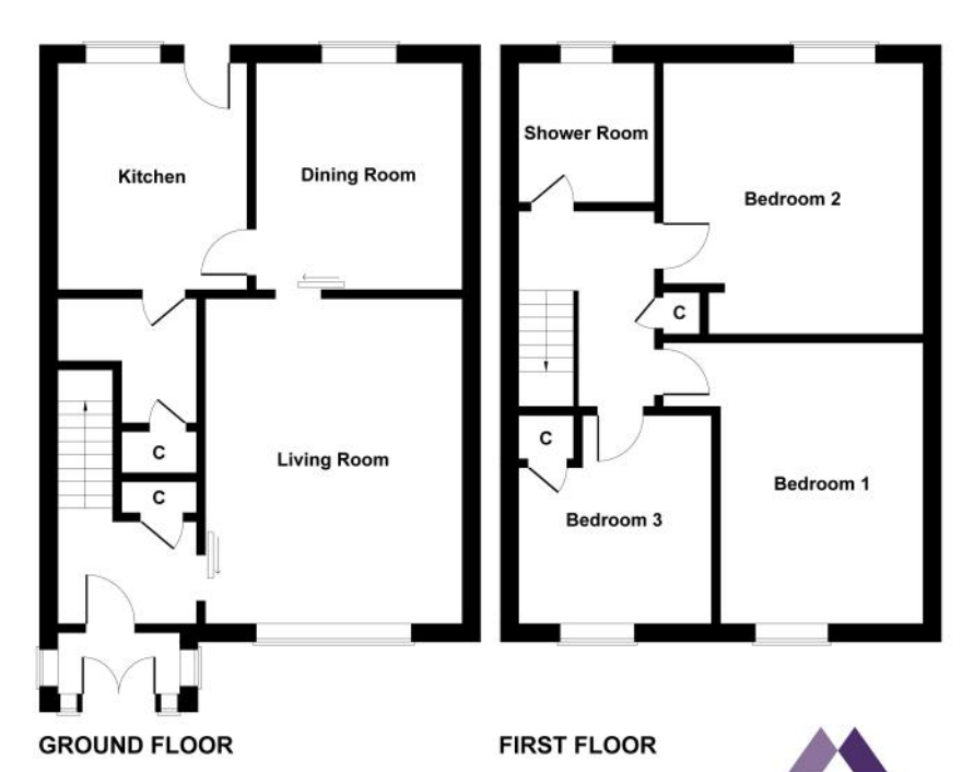
Not to Scale. Produced by The Plan Portal 2020 THOMAS MURRAY For Illustrative Purposes Only.