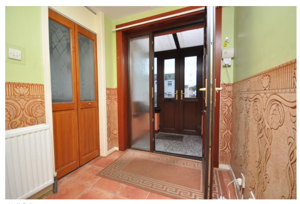
Hall & Entrance