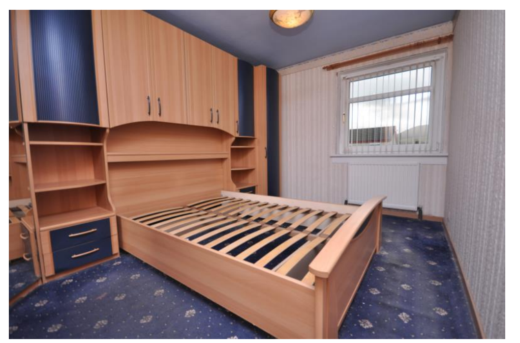
Landing Bedroom 1