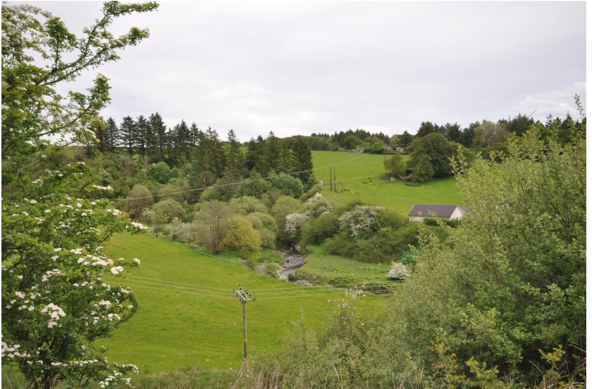
View from Plot