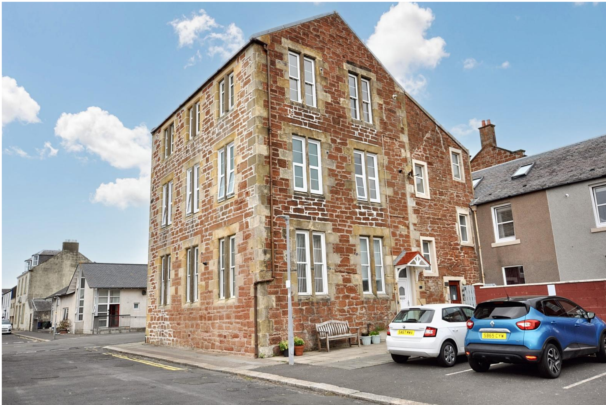
Harbour Lane side of building