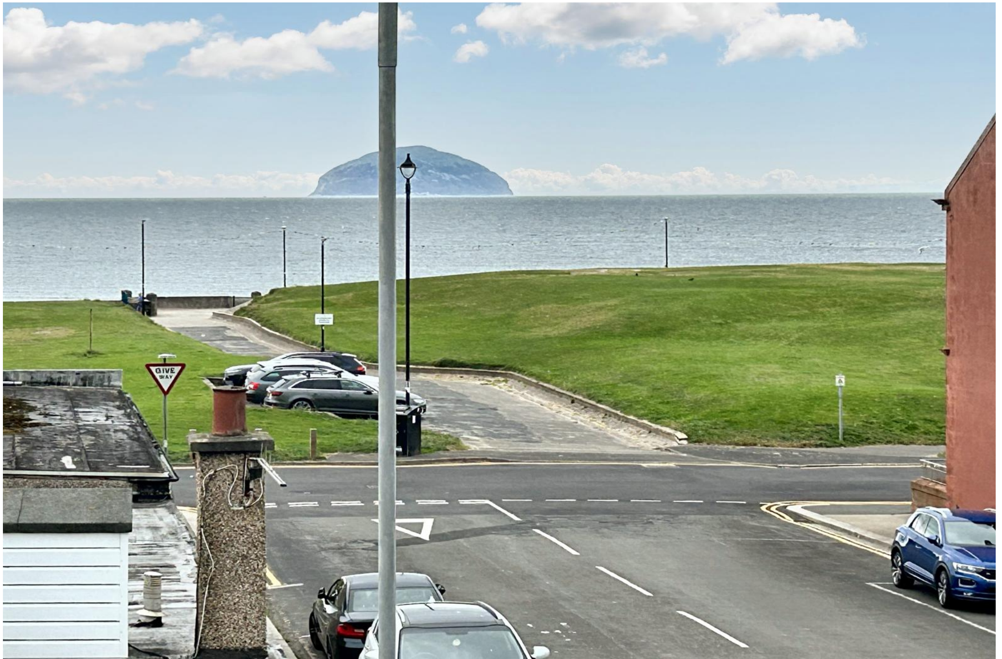
View from flat