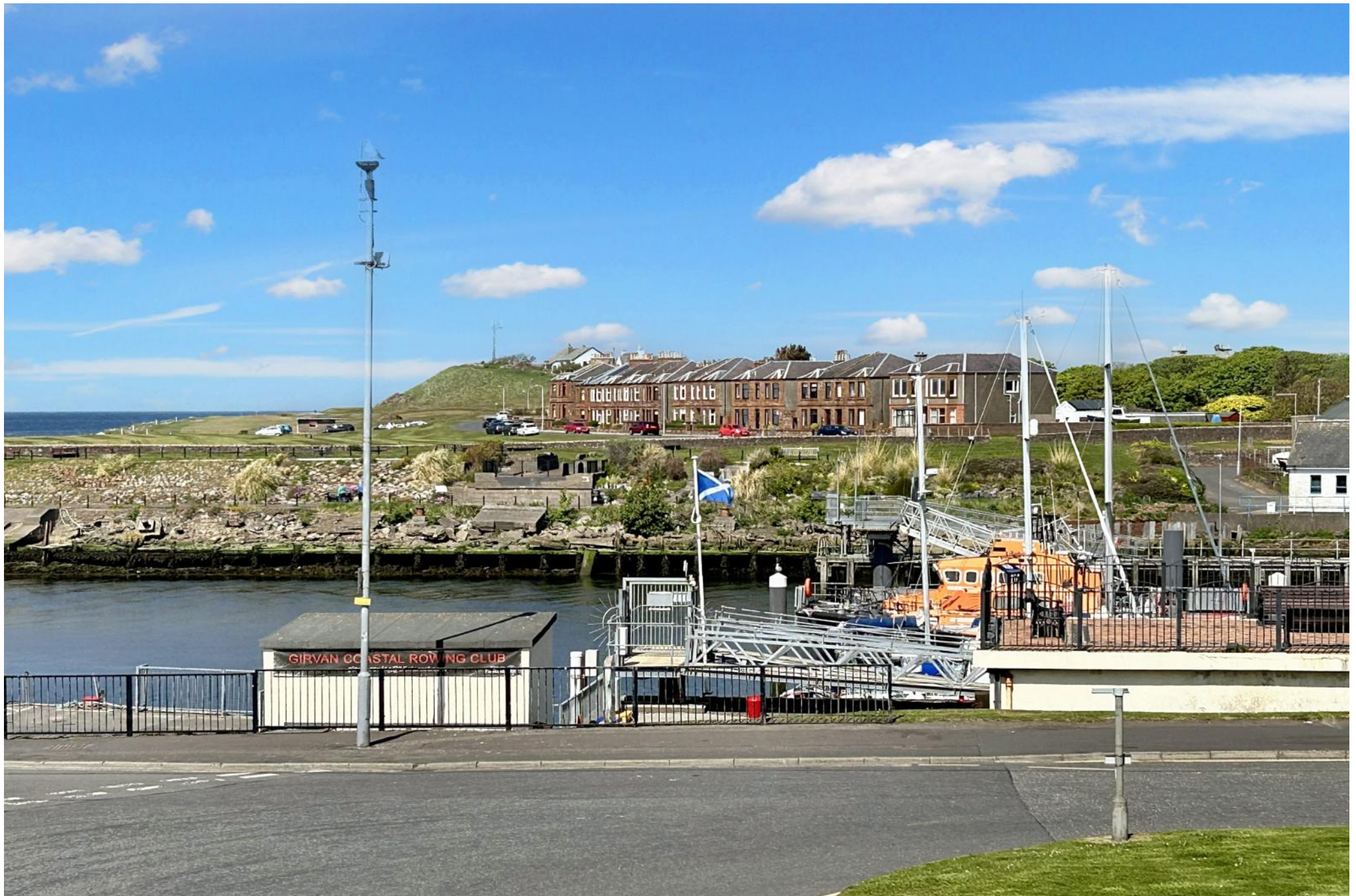
View from house