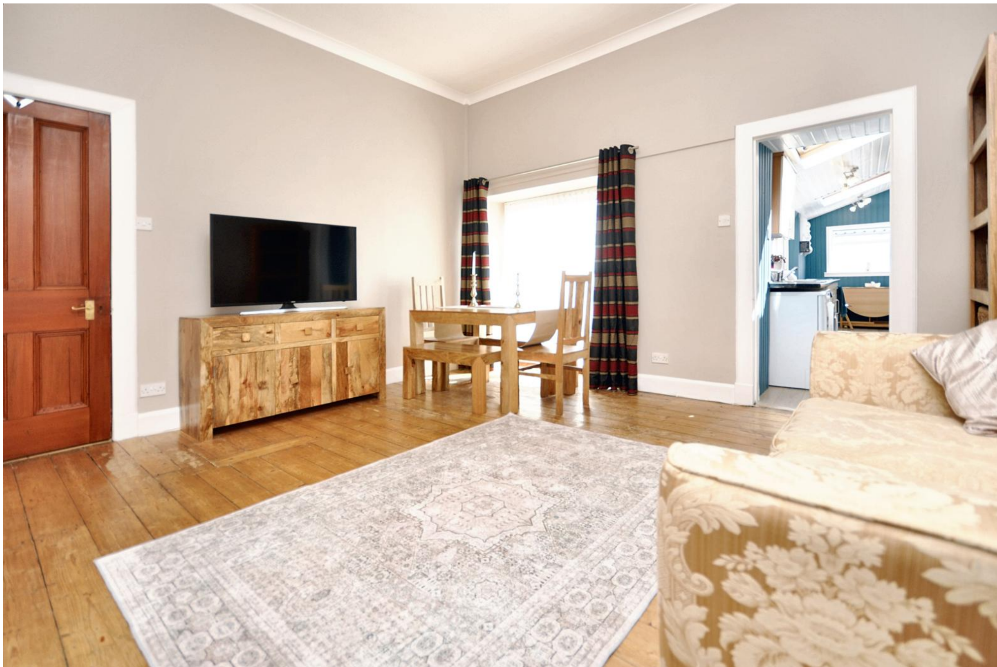
Sitting Room/Dining Room