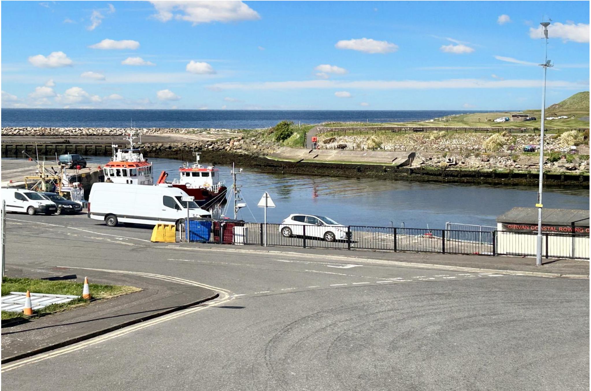
View from house