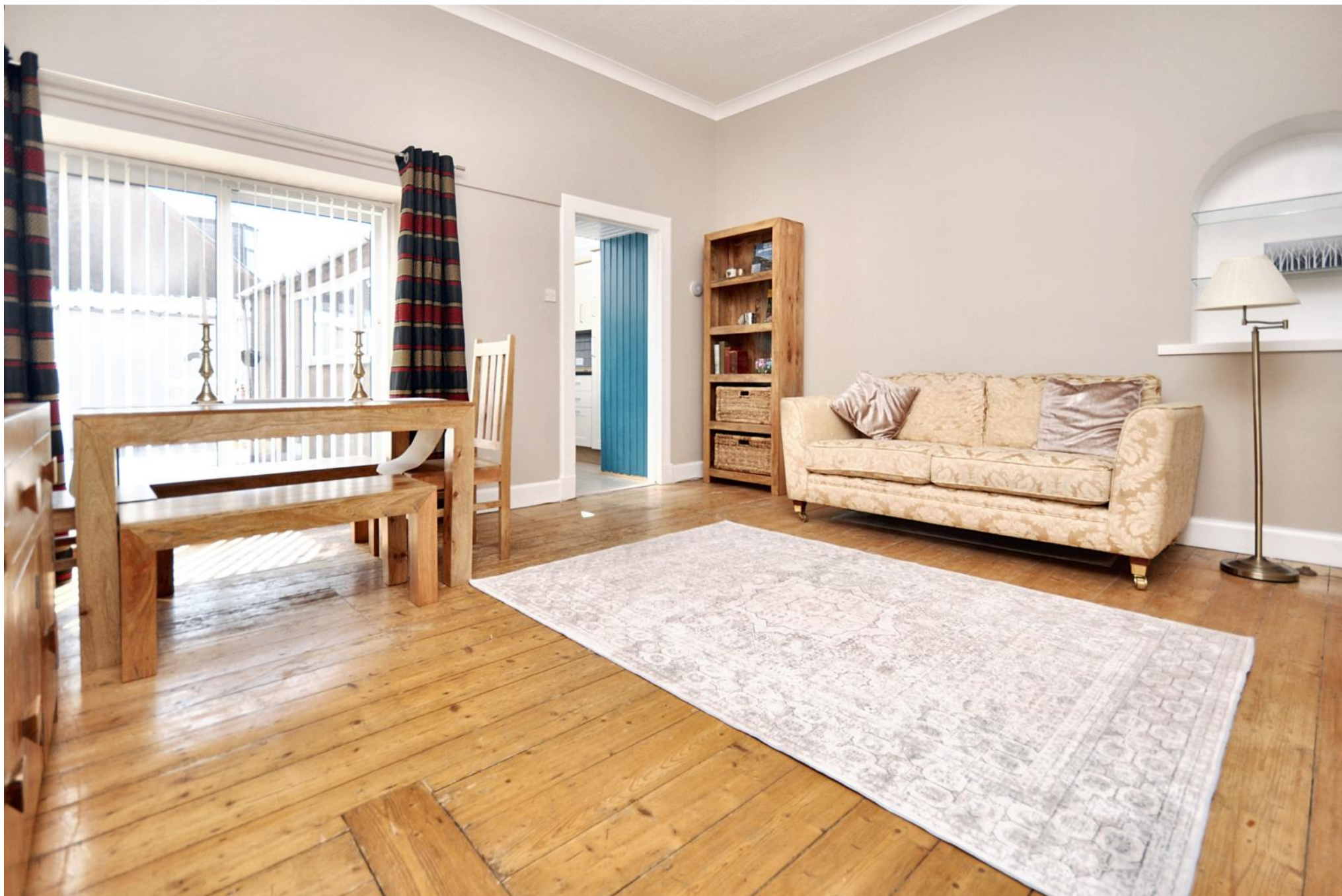
Sitting Room/ Dining Room