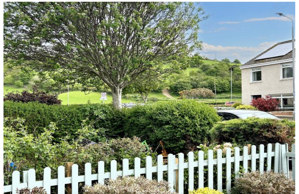
View from front garden