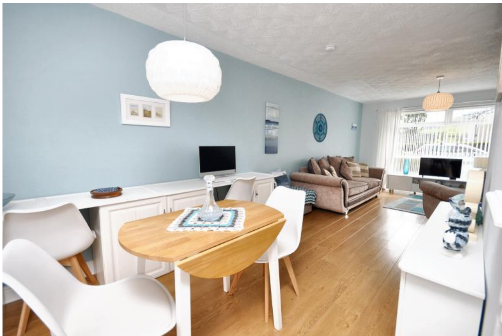
Living Room and Dining Area