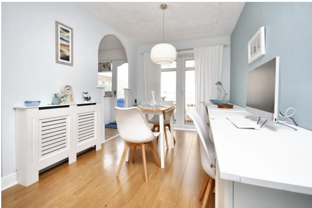
Living Room and Dining Area

Attractive 3 bedroom house in excellent decorative order