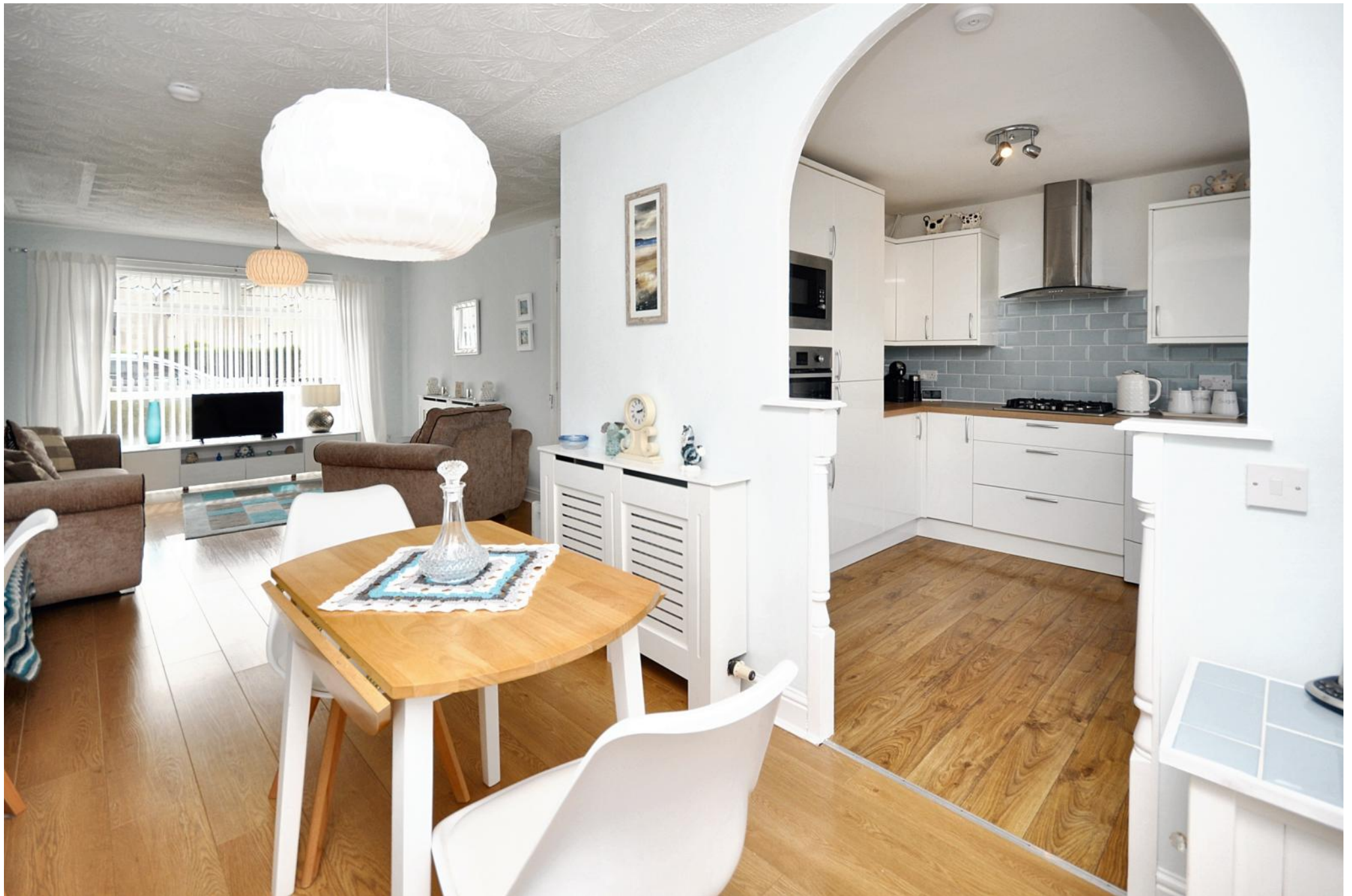
Living room and Dining Area