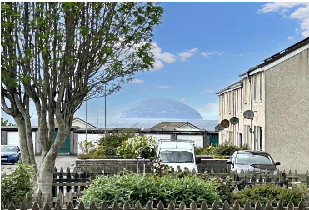
View from front garden