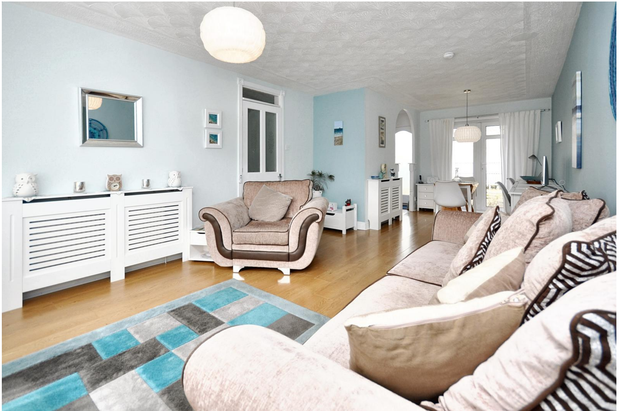
Living Room and Dining Area