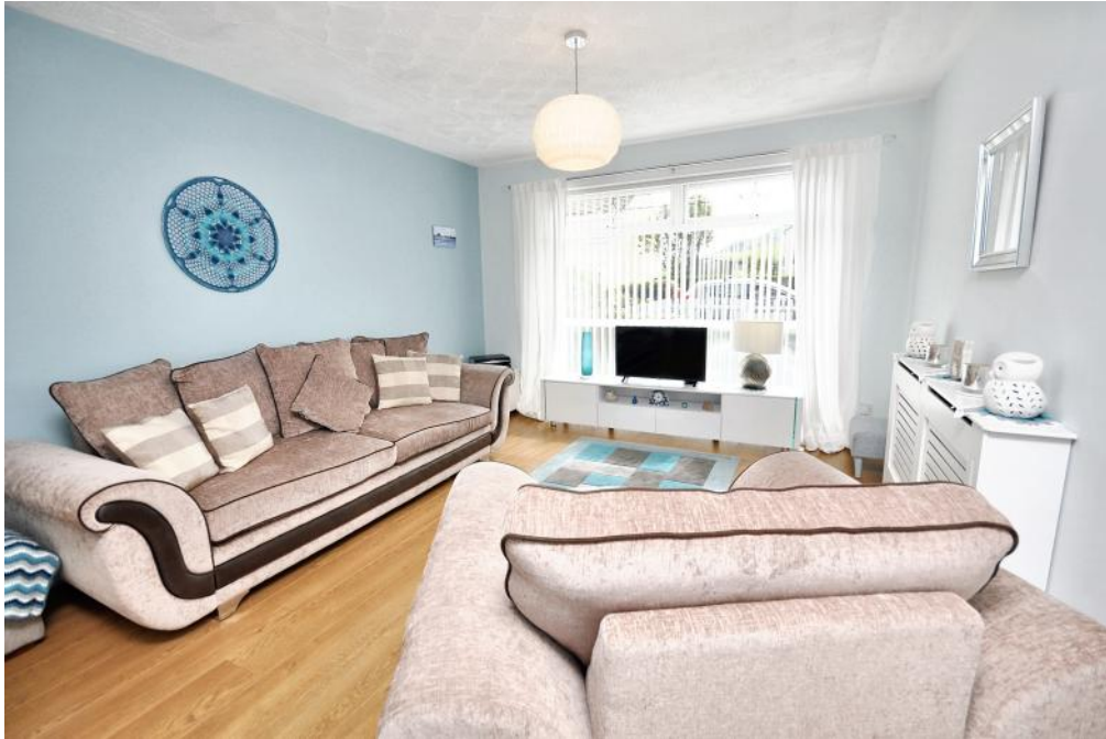
Living Room and Dining Area