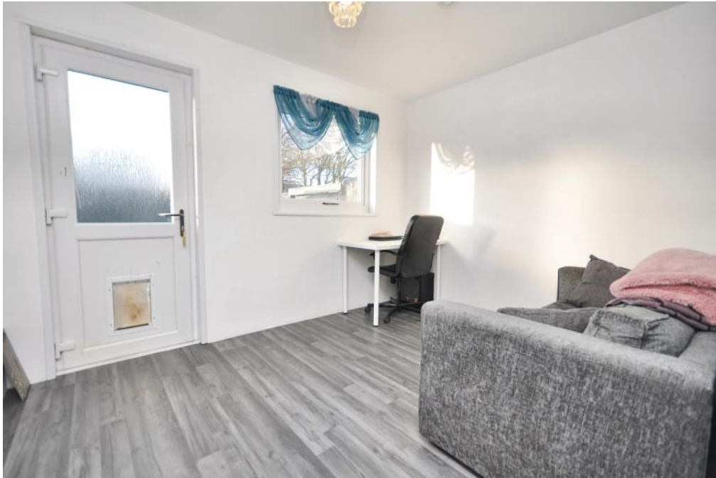
General purpose room