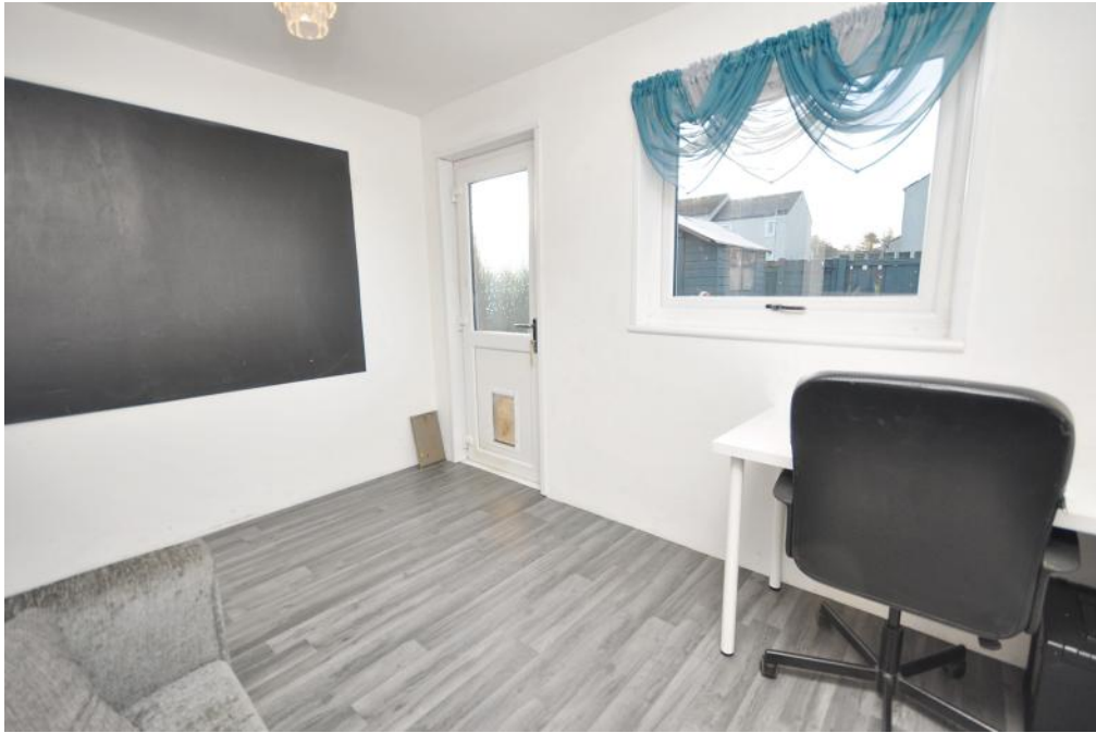
General purpose room