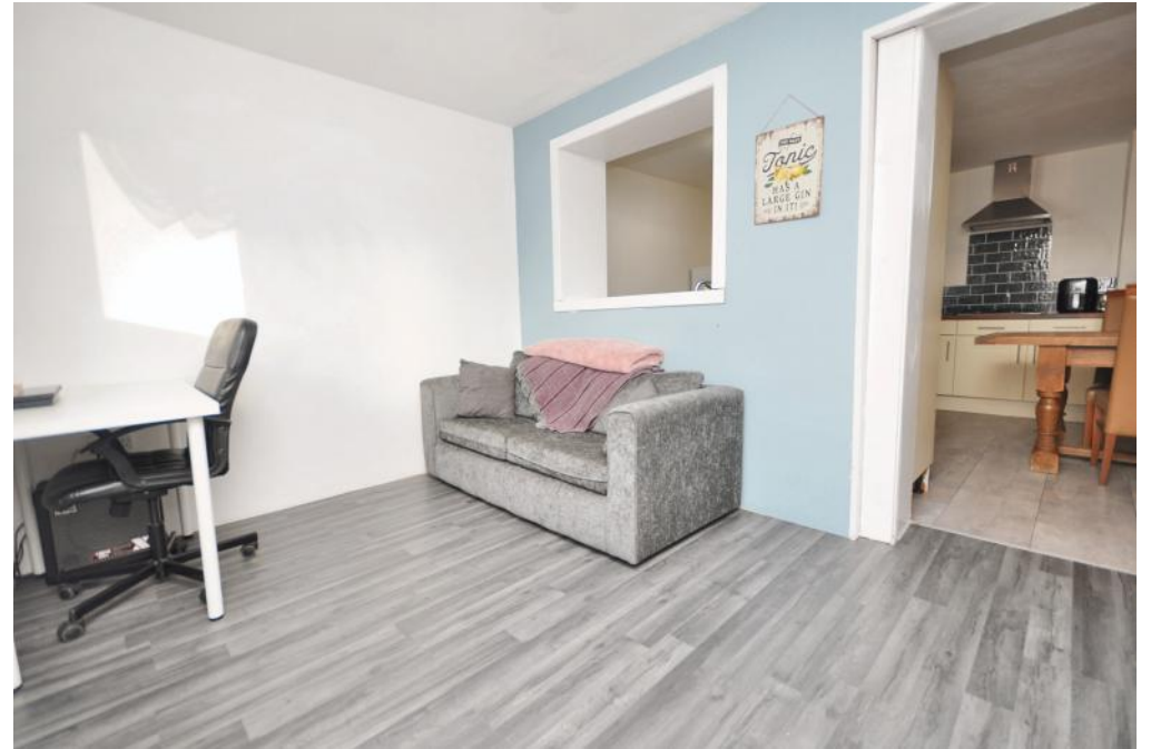
General purpose room