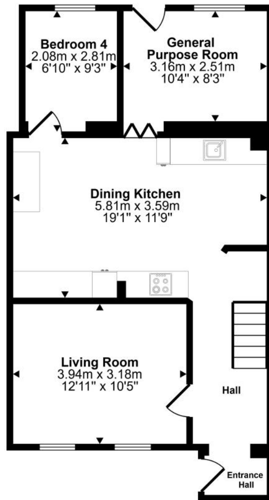
Ground Floor Approx 57 sq m / 617 sq ft

Approx Gross Internal Area 98 sq m / 1054 sq ft