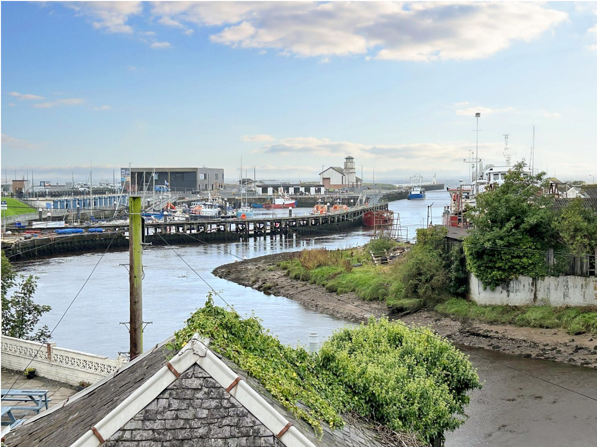
View from Kitchen