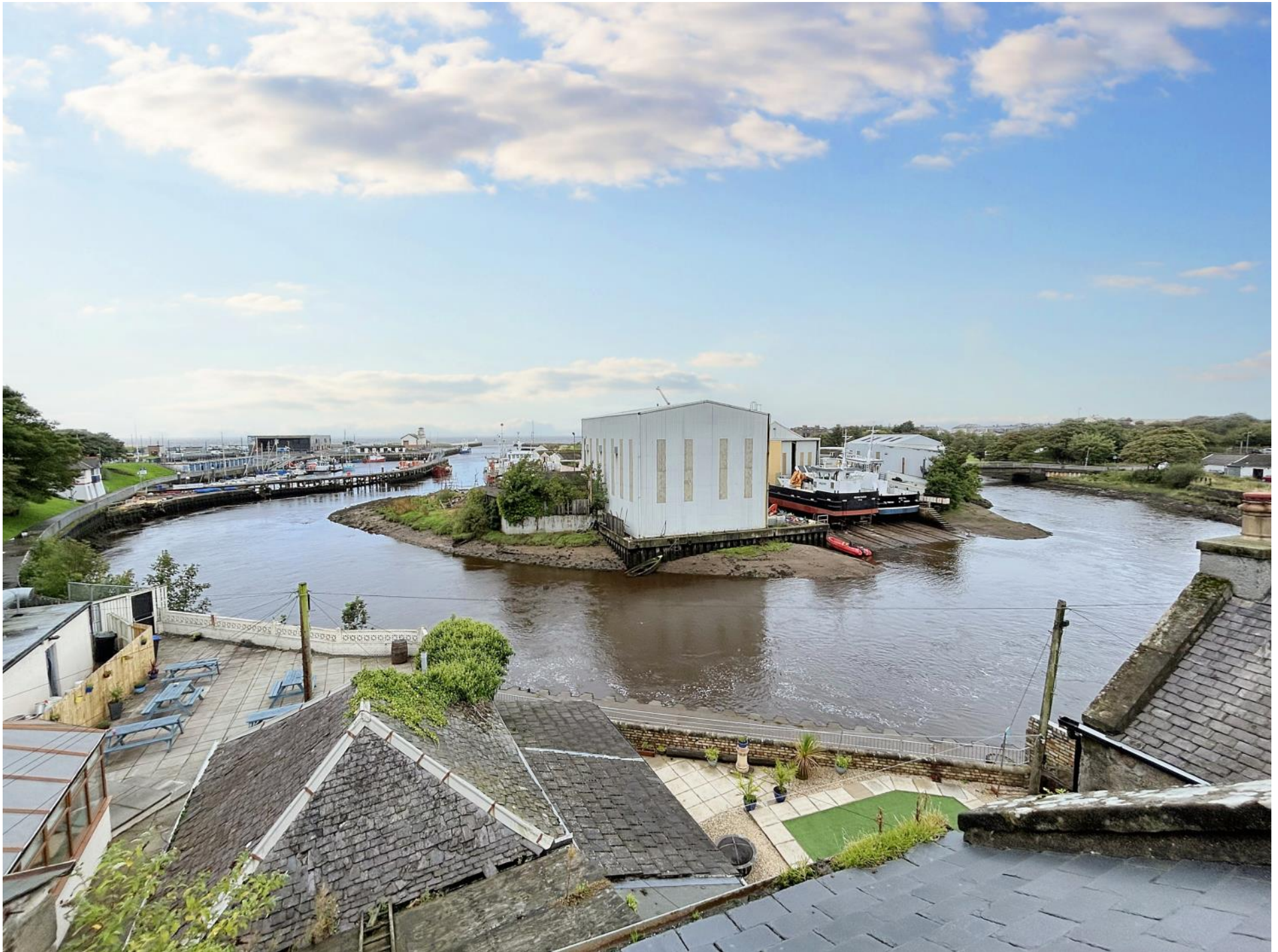
View from Bedroom 2