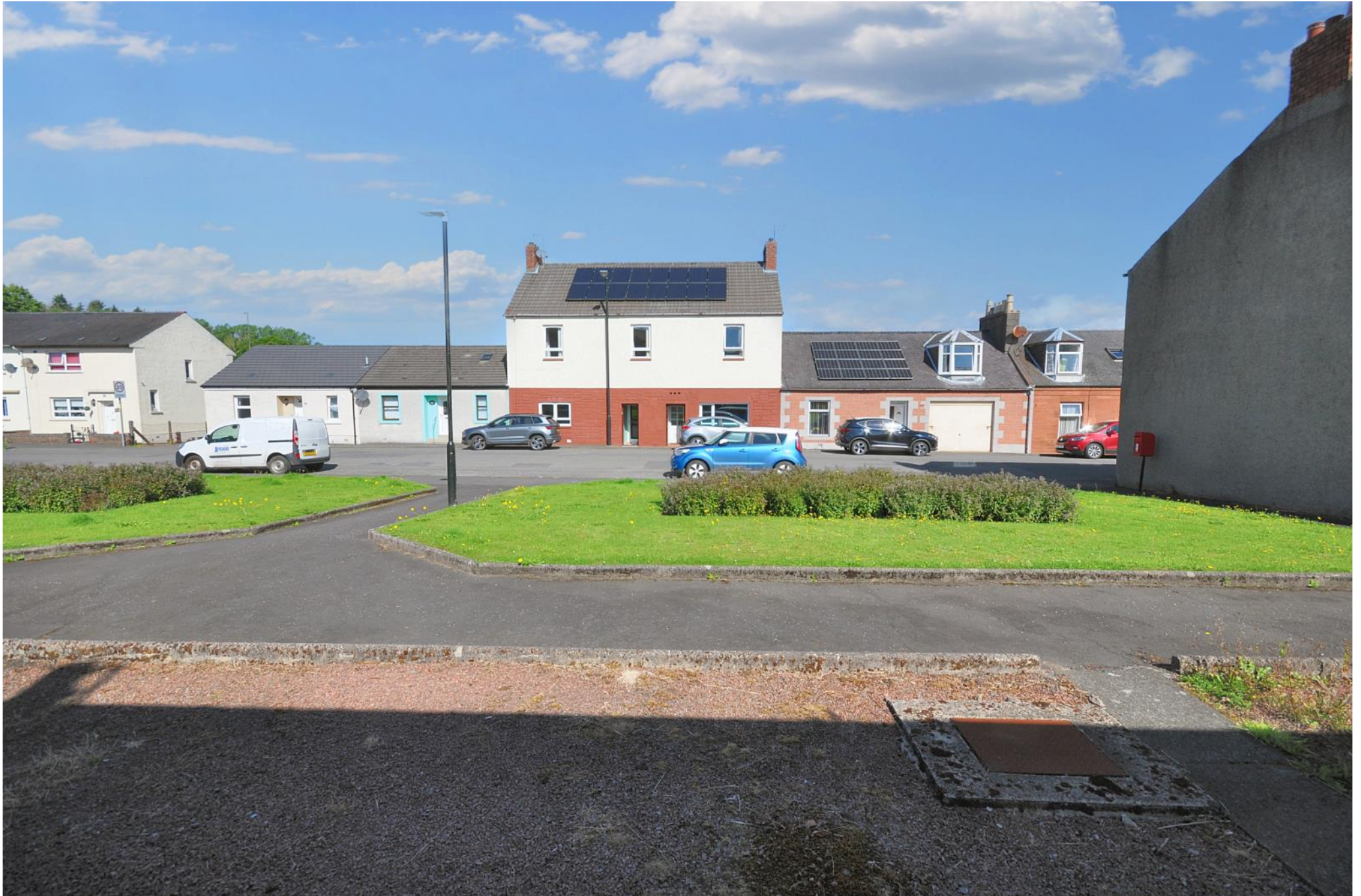
Outlook From Front of House