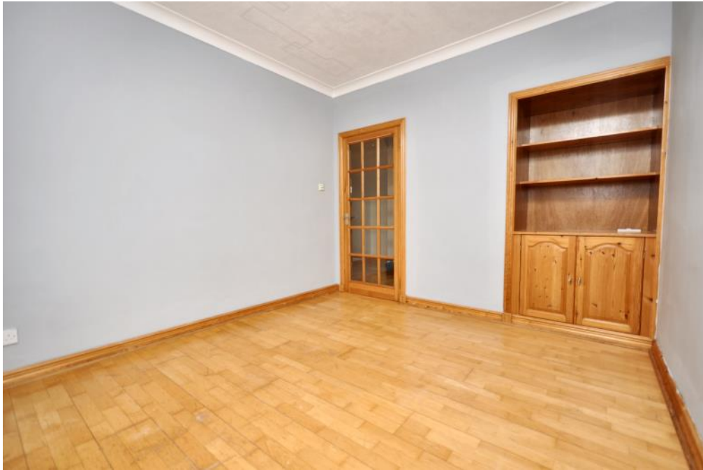
Bedroom 3/Dining Room