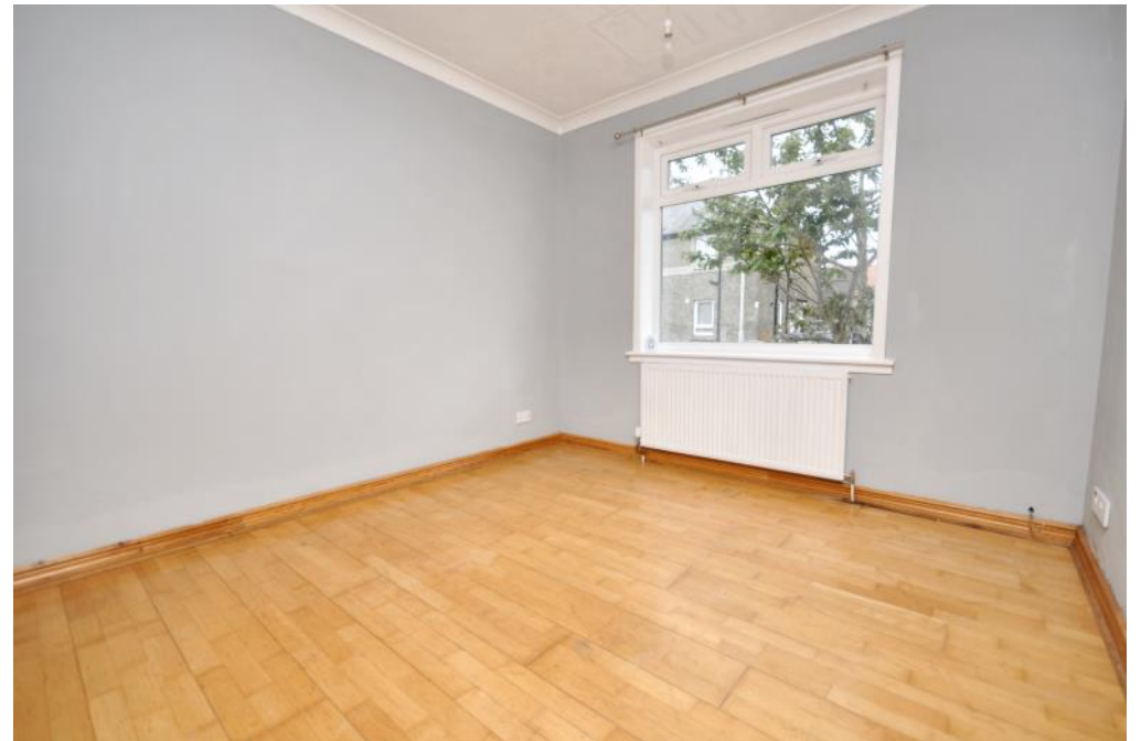
Bedroom 3/Dining Room