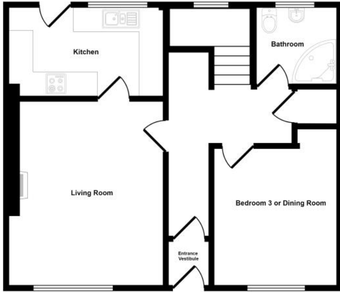
Ground Floor Approx 58 sq m / 622 sq ft