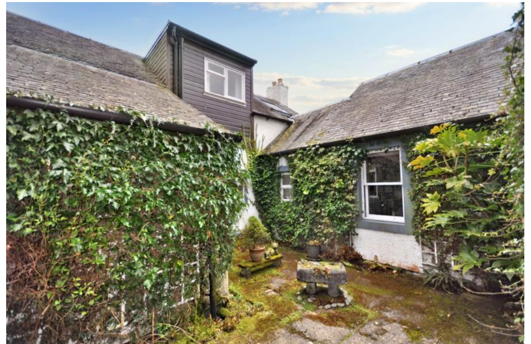
Rear of House