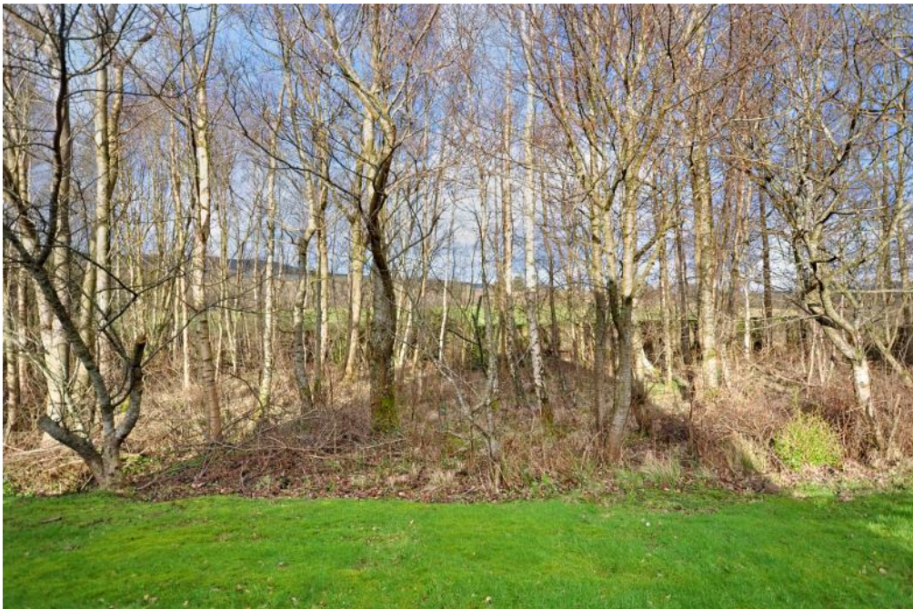
View From Rear of Lodge