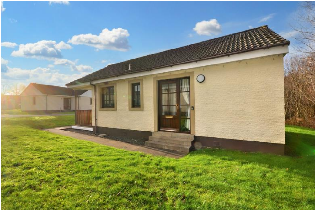
Side Elevation and Entrance