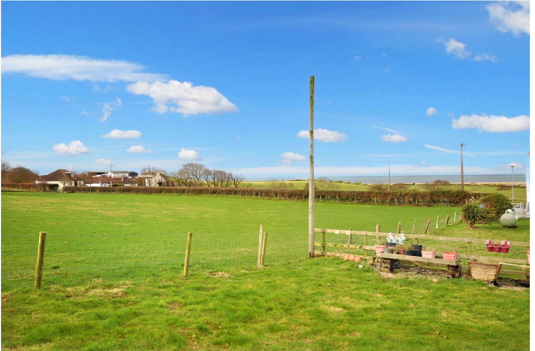
View from Garden