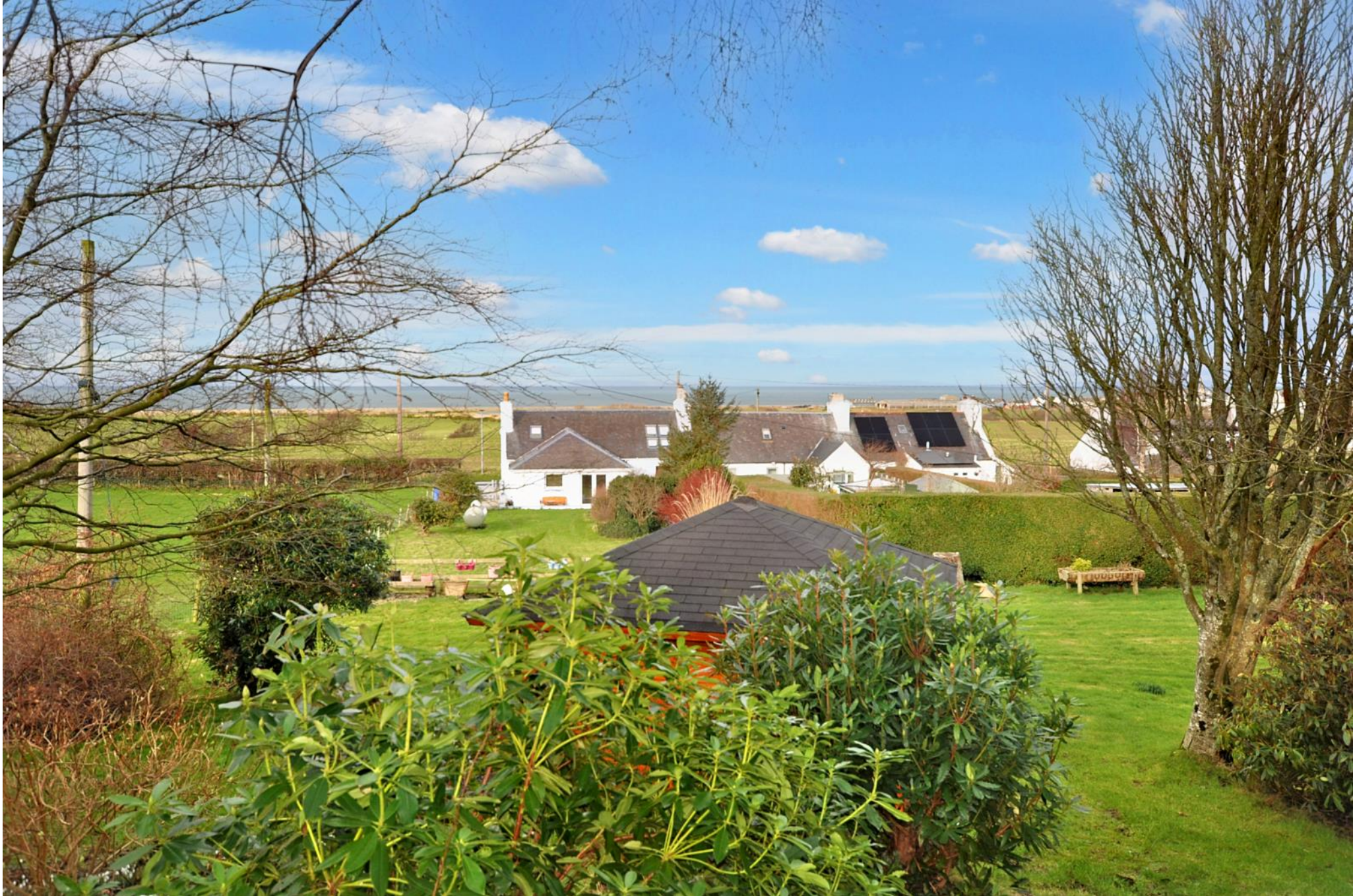
View from Garden