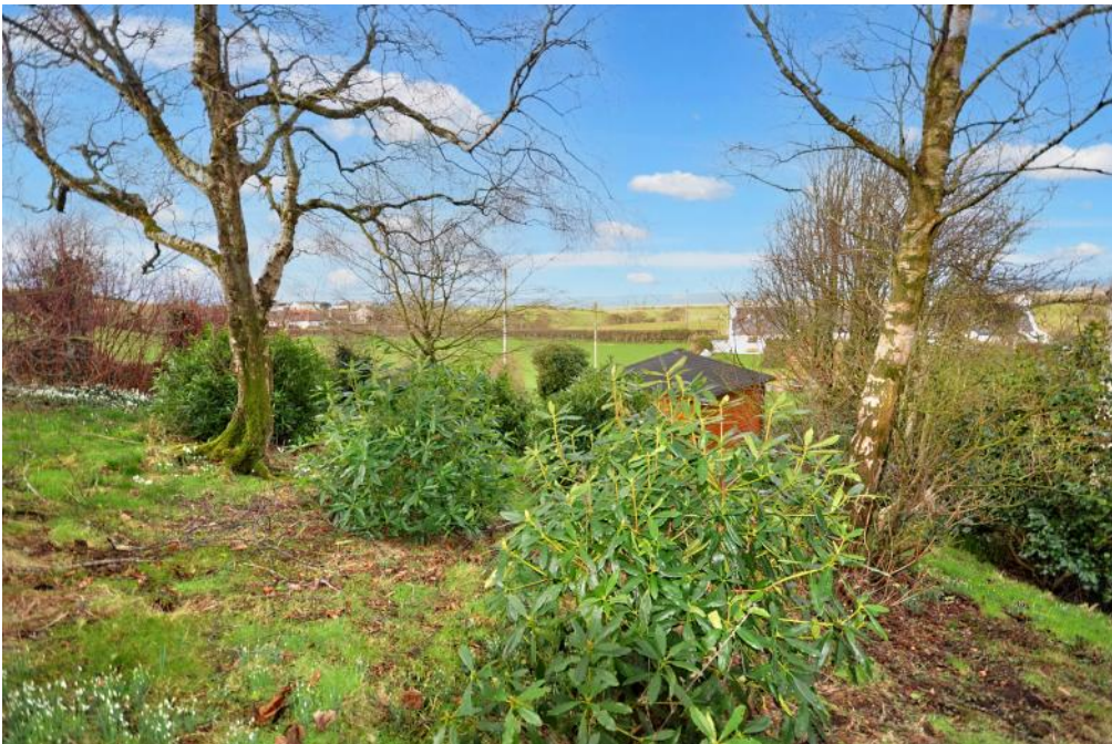
View from Top of Garden