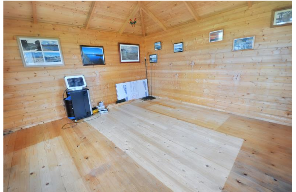
Summer House Interior