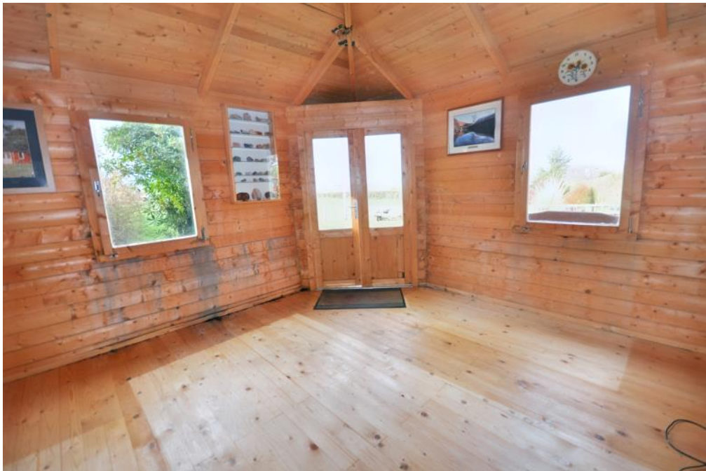
Summer House Interi-