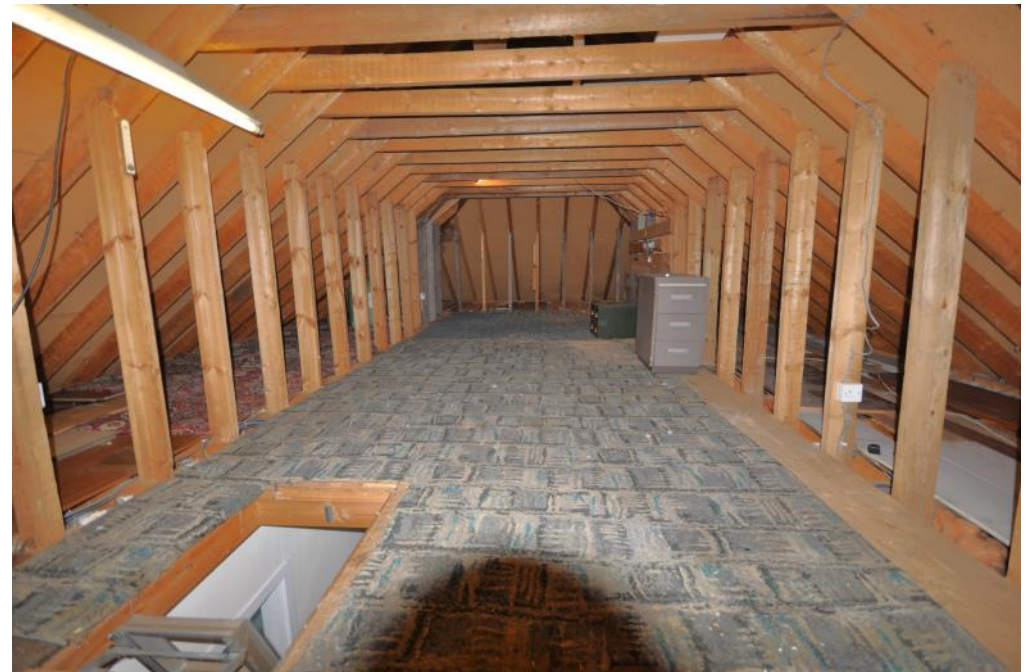
Part Floored Loft