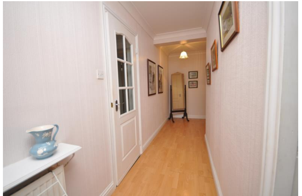
Ground Floor Hall