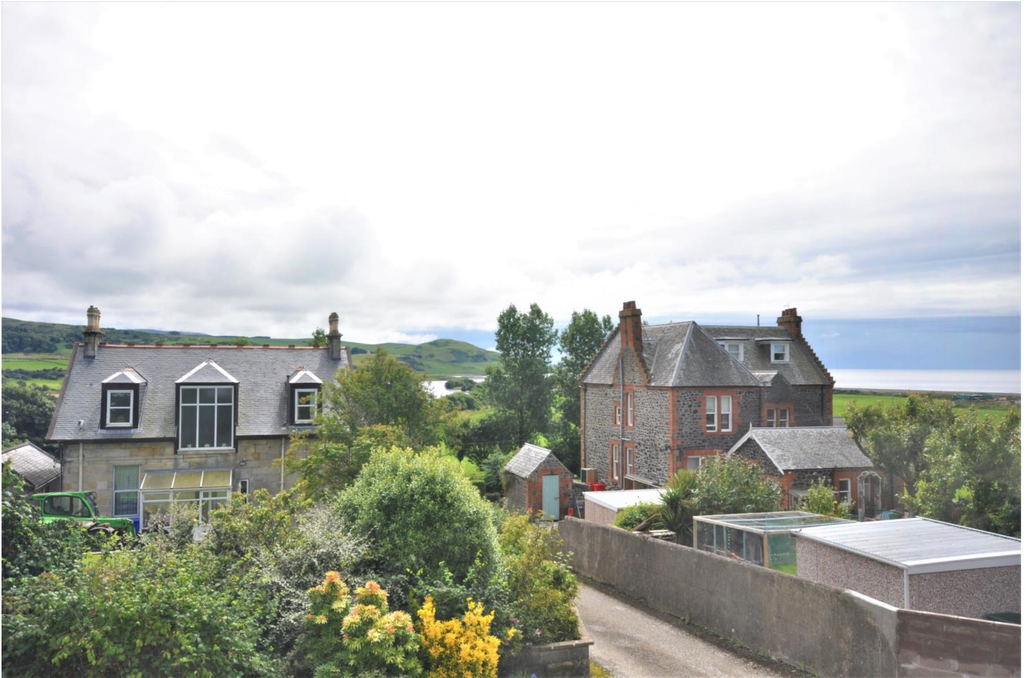
View from property