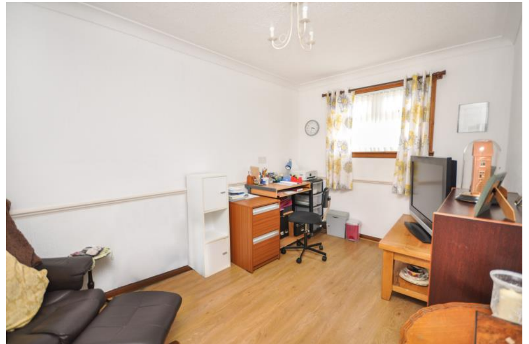
Office / Bedroom 5