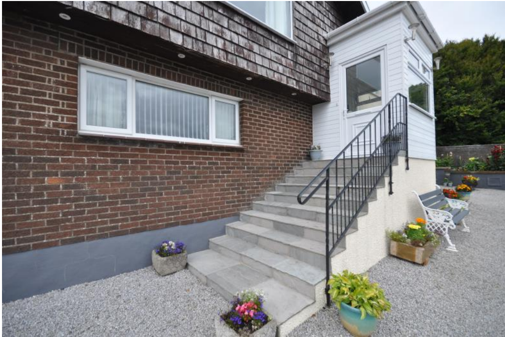
Steps to Entrance Porch