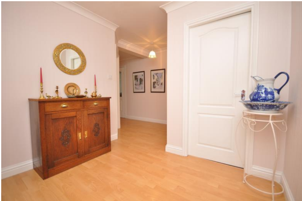
Ground Floor Hall