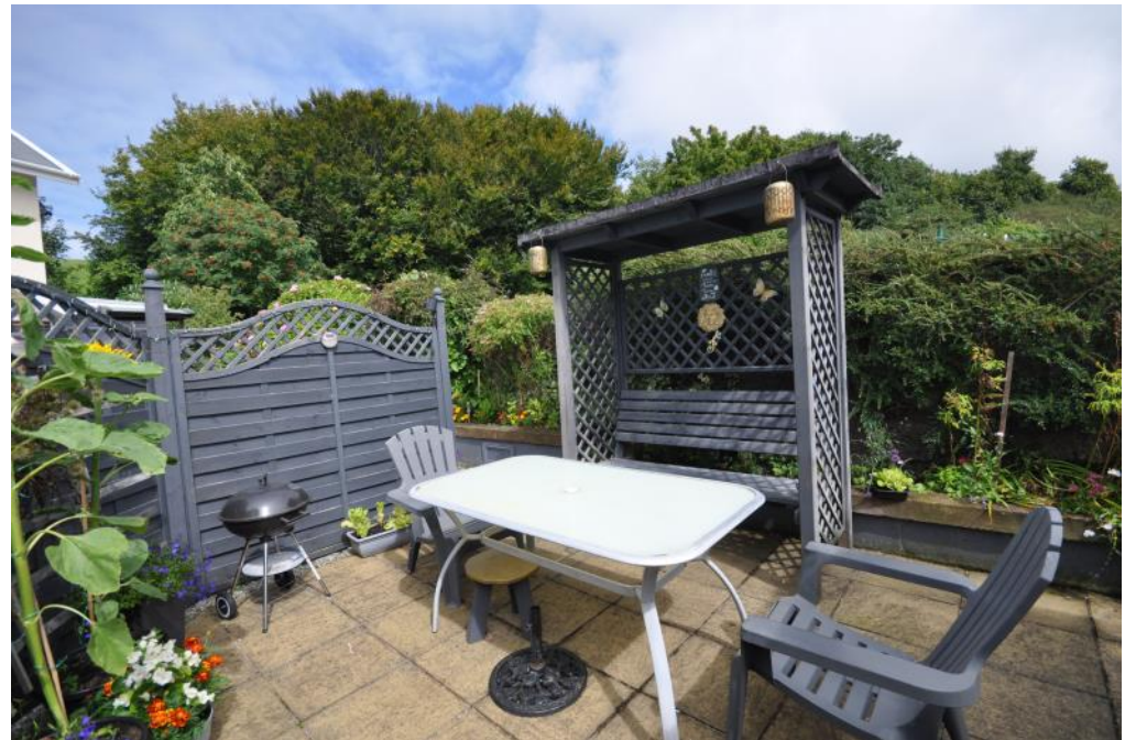
Patio area at front