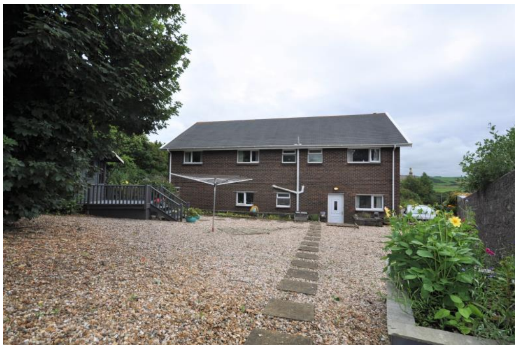
Rear Elevation and Garden