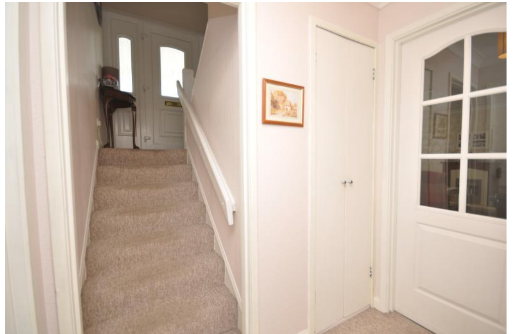
Ground Floor Hall