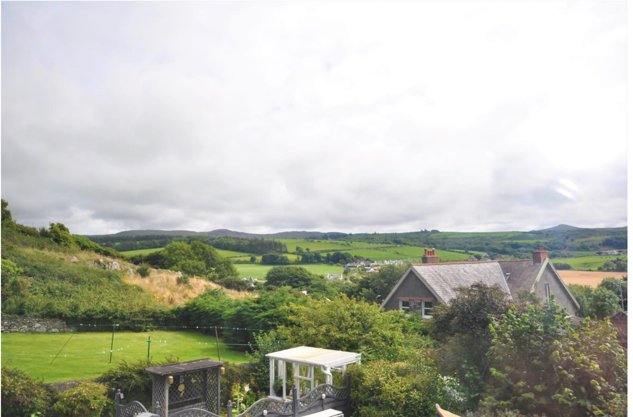
View from property