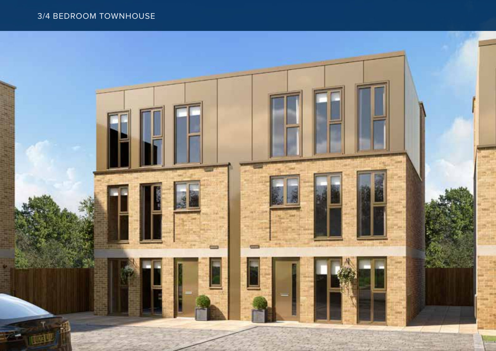
3/4 BEDROOM TOWNHOUSE

The Hexham is the ideal family home, a three/four bedroom property spread over three floors. The middle floor hosts the main bedroom with en suite along with a living room. The two double bedrooms and single bedroom on the second floor share a family bathroom. Downstairs, a kitchen-dining area and separate snug can accommodate the various demands of family life with the addition of a convenient ground floor cloakroom.