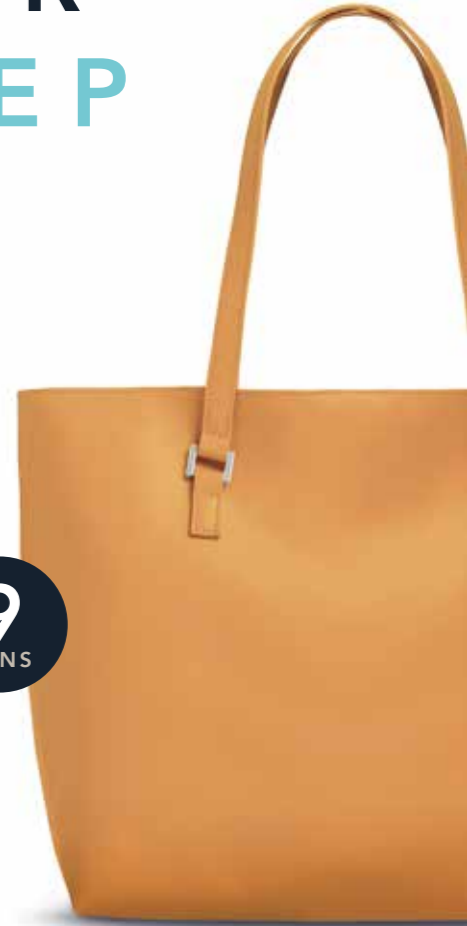
Fraser's Buchanan Street