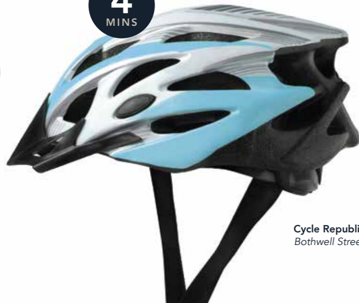
Cycle Republic Bothwell Street