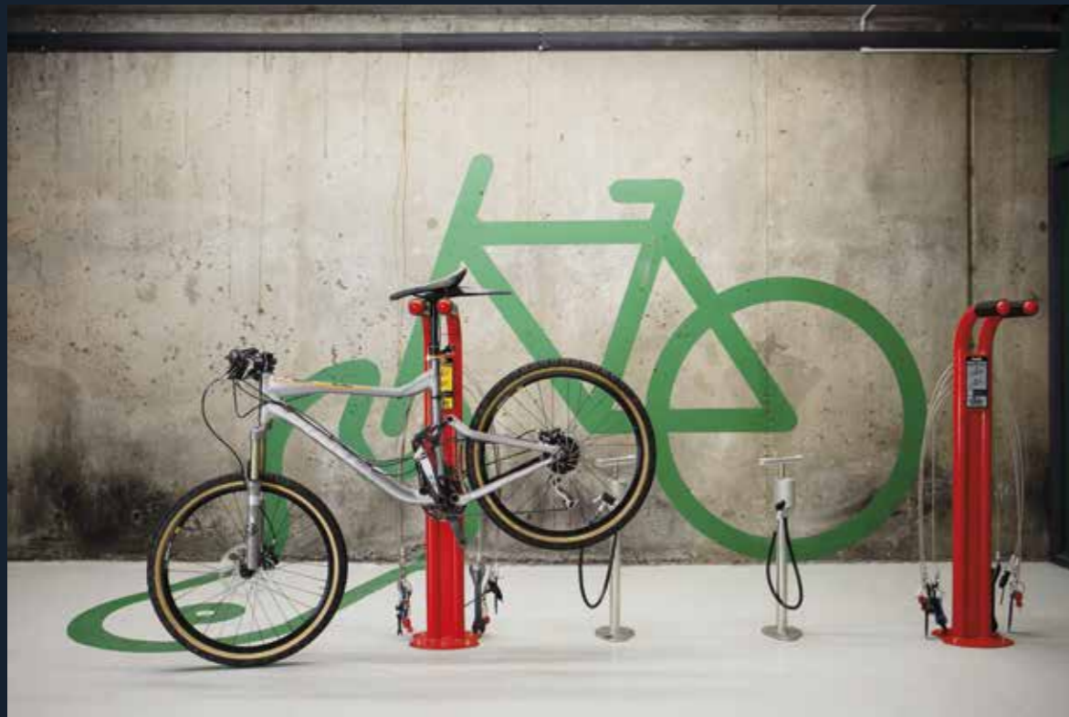
01 Cycle maintenance station by Five At Heart