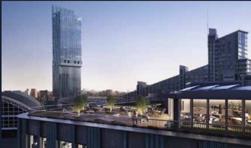
04 Windmill Green rooftop