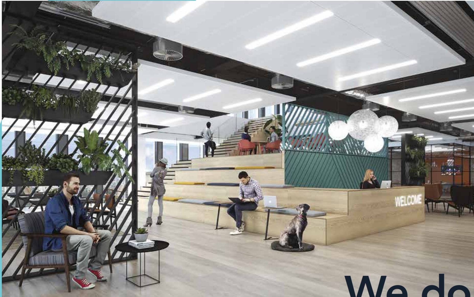
04 Office fitout (Raft)