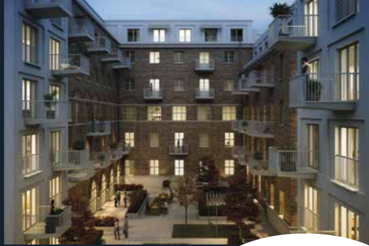
01 Geisberg courtyard