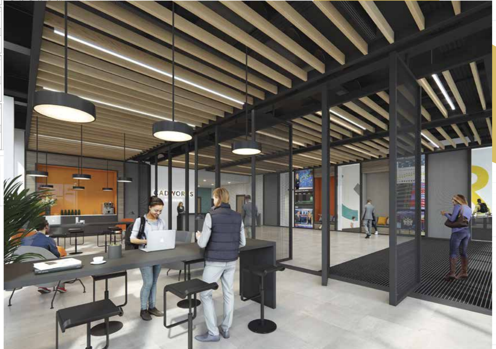
01 Reception and breakout meeting area

Glasgow's very own Alasdair Gray famously wrote: 'Work as if you live in the early days of a better nation'. Cadworks is our re-imagining of that 'better nation', a place where the working community is healthy, connected, and diverse.