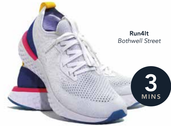
Run4It Bothwell Street