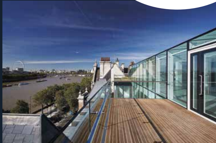
02 The view from the balcony at 58VE