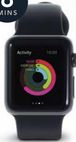
Apple Buchanan Street