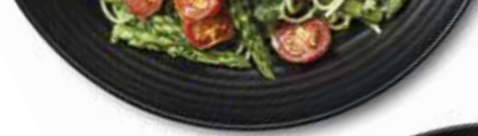
La Lanterna Hope Street