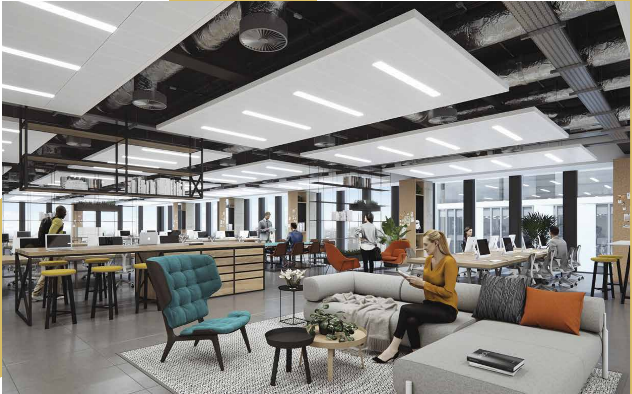
05 Office fitout (Raft)