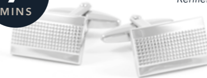
Moss Bros Renfield Street