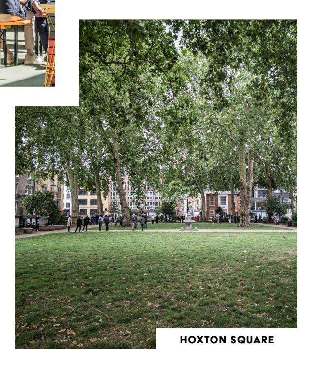
TAKE A BREATH