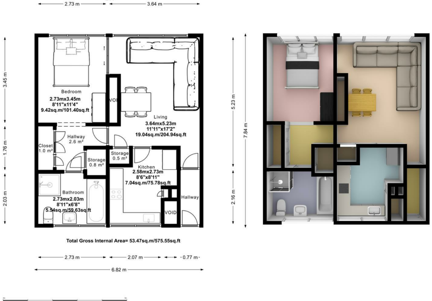
Floor Plans For 79 Dagmar Court London E14

These particulars, whilst believed to be accurate are set out as a general outline only for guidance and do not constitute any part of an offer or contract. Intending purchasers should not rely on them as statements of representation of fact, but must satisfy themselves by inspection or otherwise as to their accuracy. No person in this firm's employment has the authority to make or give any representation or warranty in respect of the property.