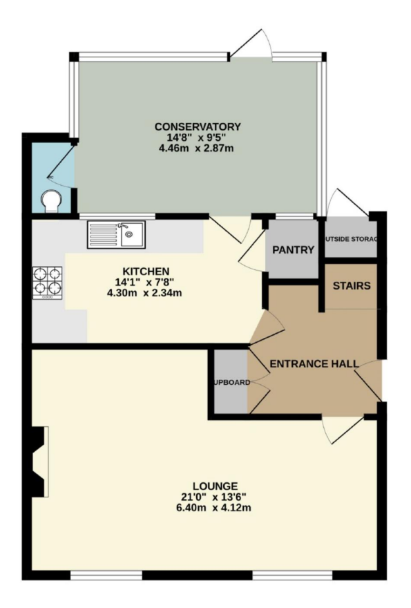
GROUND FLOOR 592 sq.ft. (55.0 sq.m.) approx.