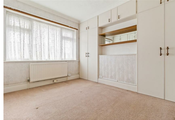
Dining room 14'5 x 11'7 (4.39m x 3.53m)