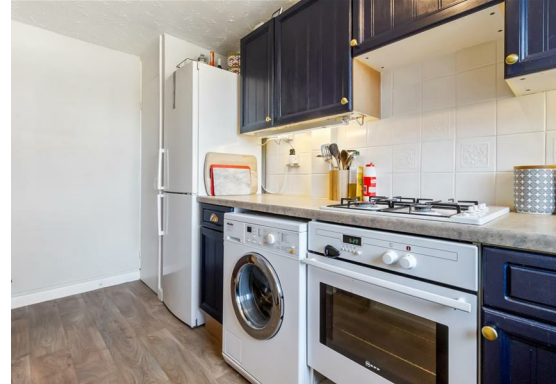
Kitchen 13'5 x 5'10