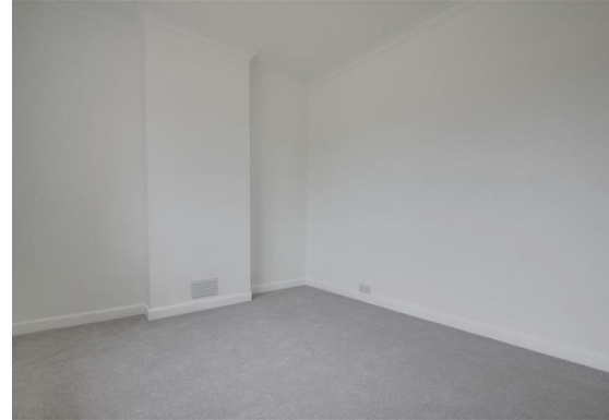
Bedroom 1 11'4 x 10'6 (3.45m x 3.20m)