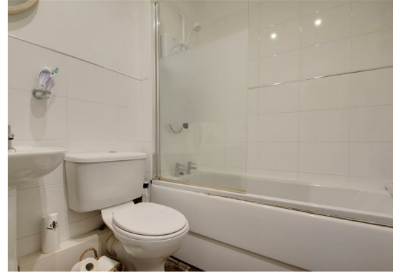
Bathroom Residents Parking