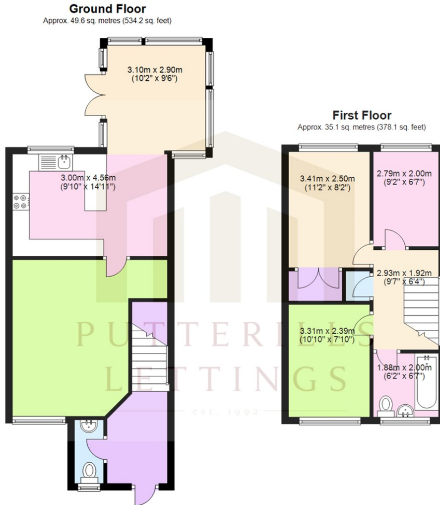
Ground Floor Approx. 49.6 sq. metres (534.2 sq. feet)