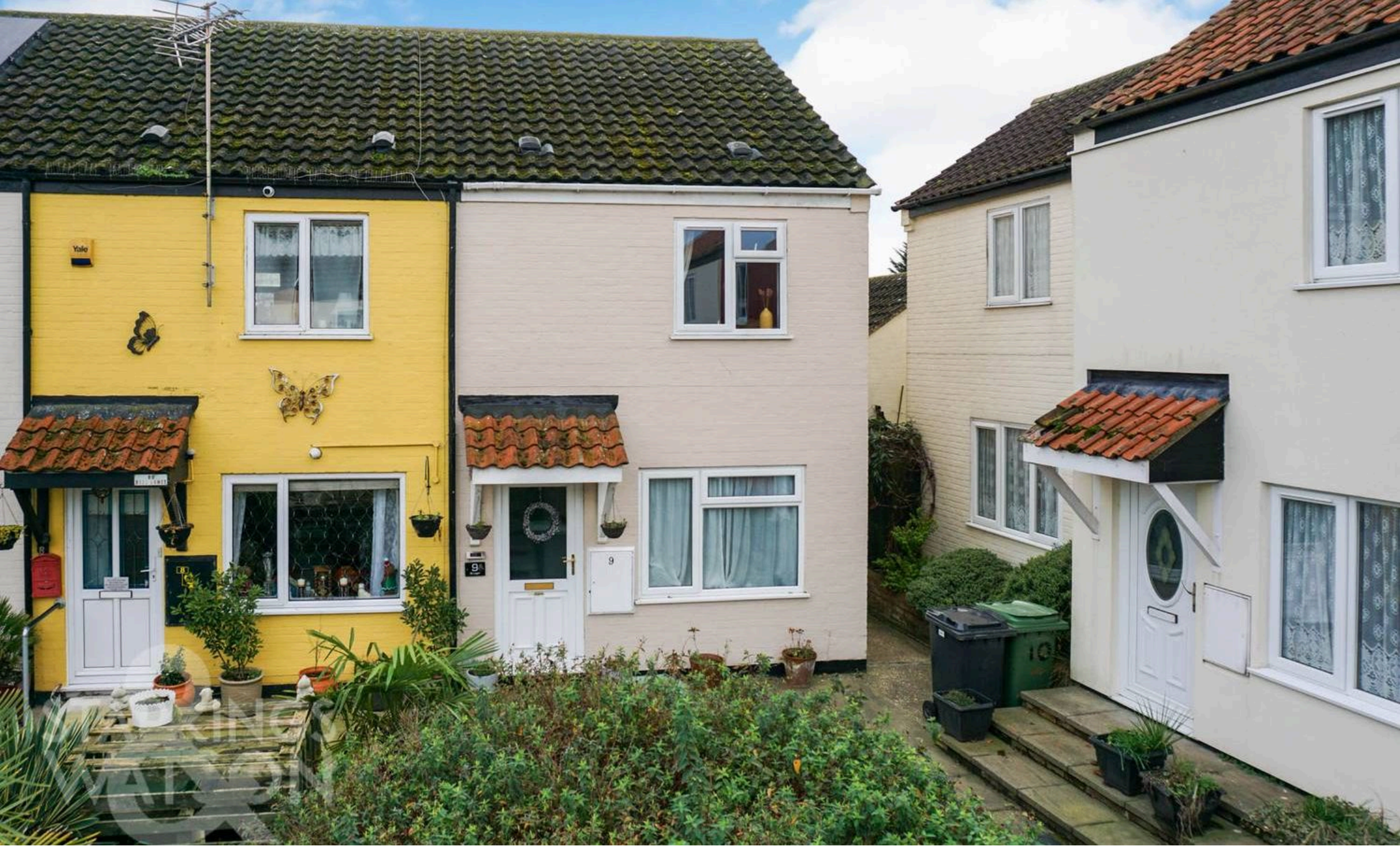
St. Leger, Long Stratton - NR15 2SY