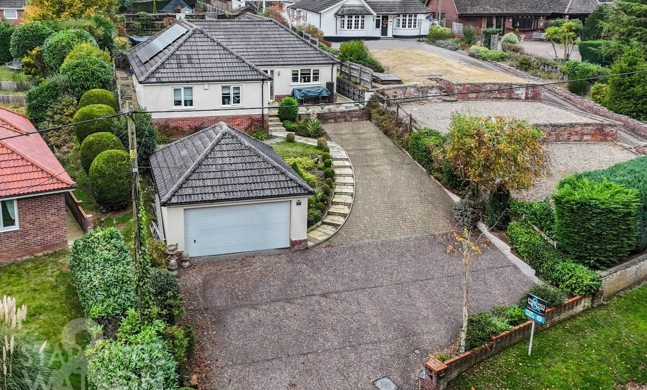
Sandy Lane, Taverham - NR8 6JU