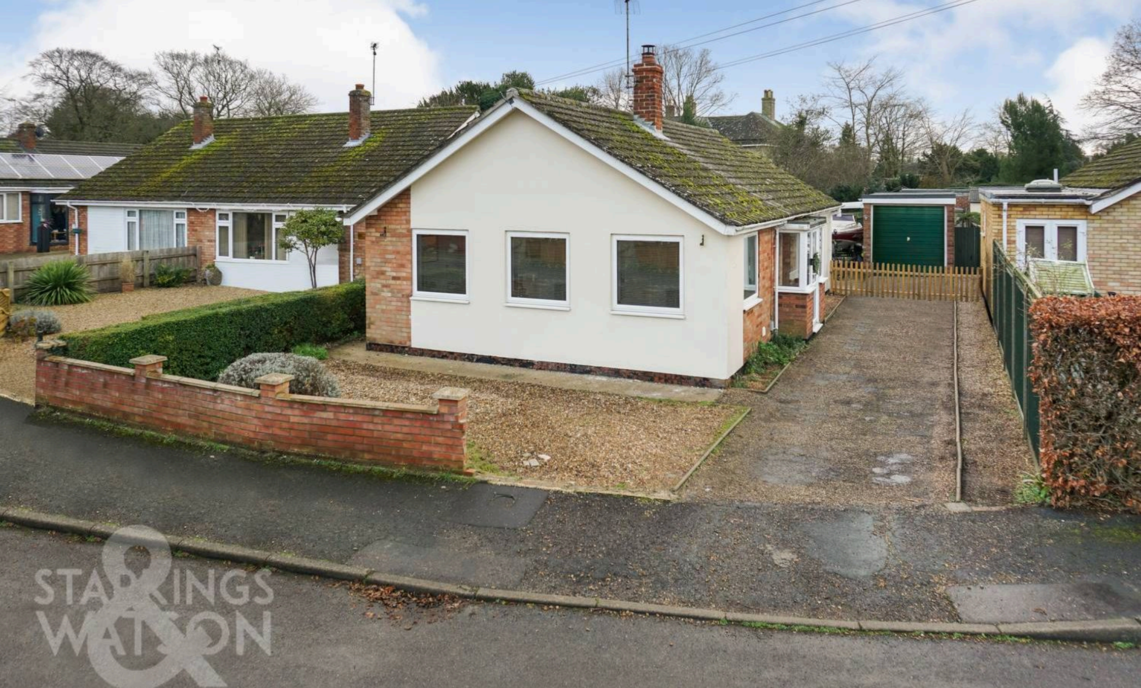
Elms Close, Earsham - NR35 2TD