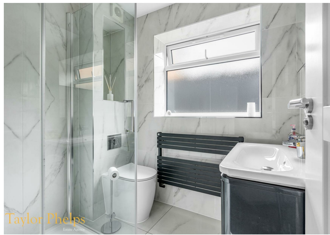
Taylor Phelps Estate Agency