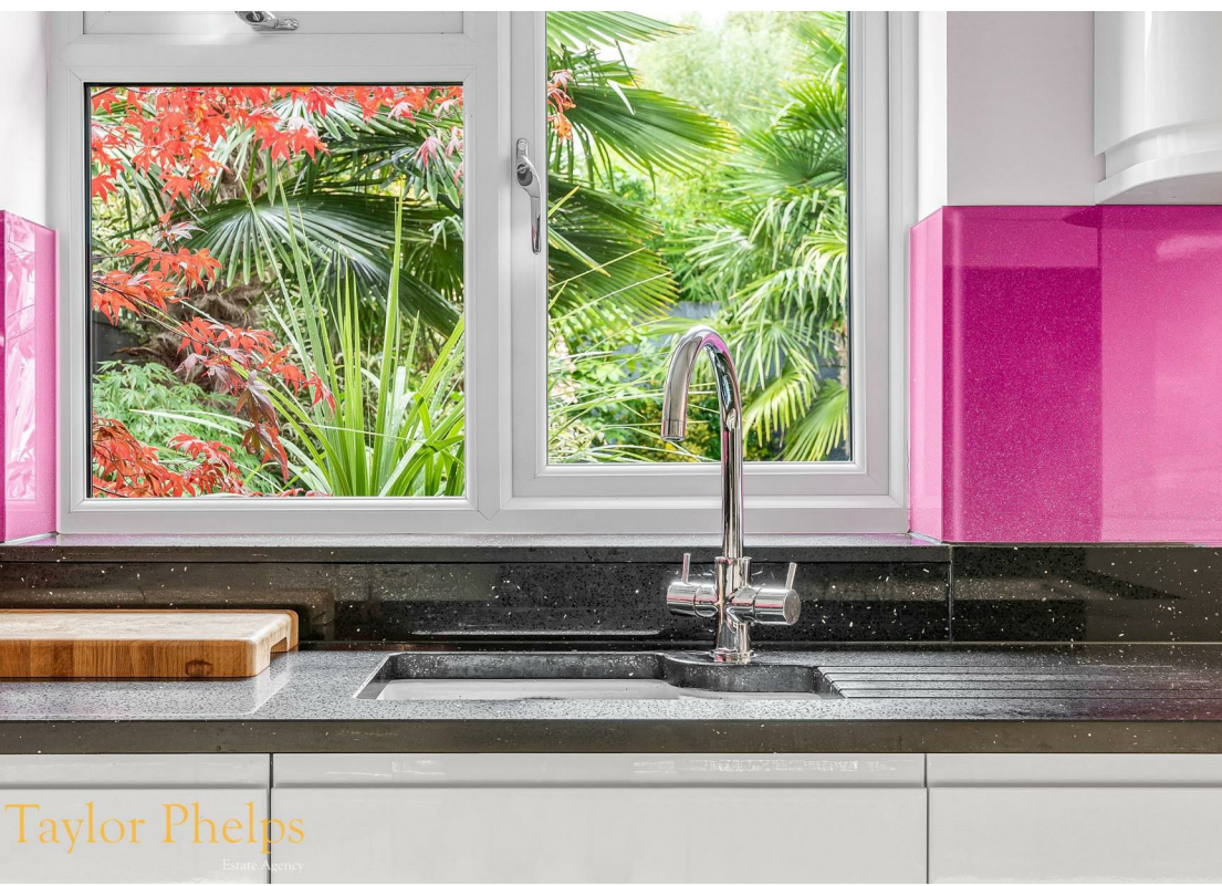
Taylor Phelps Estate Agency