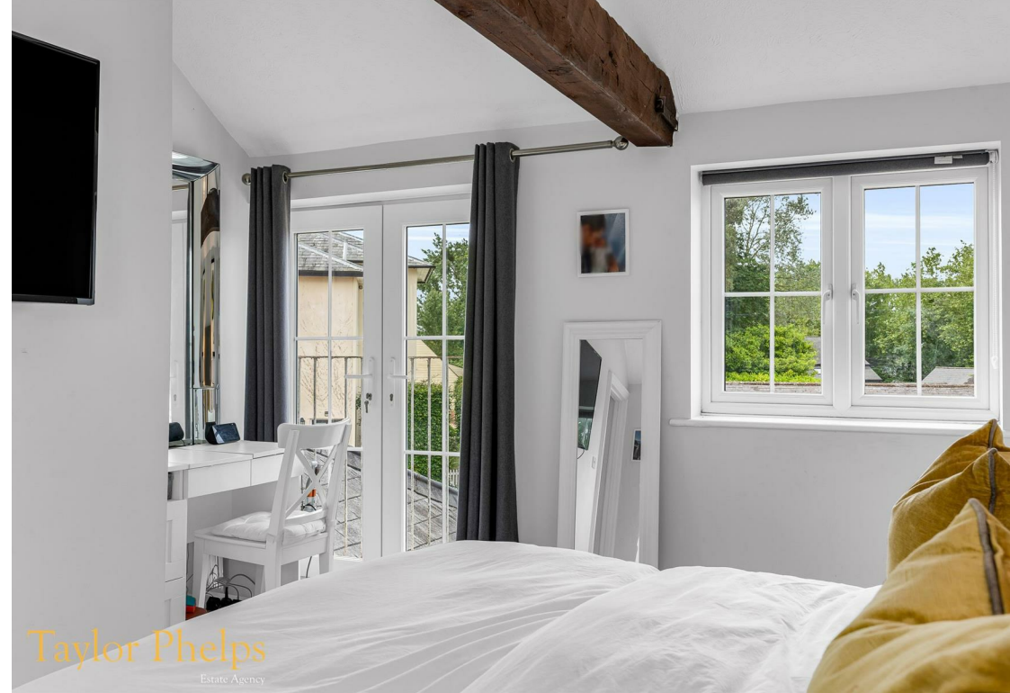
Taylor Phelps Estate Agency