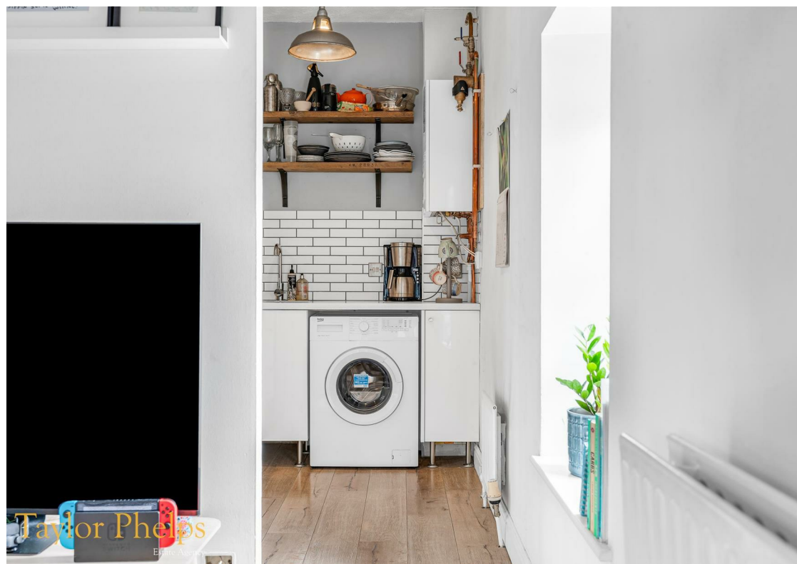
Taylor Phelps Estate Agency