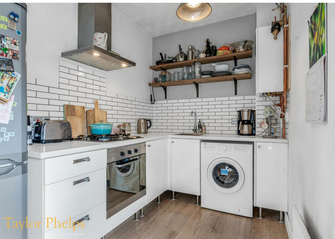
Taylor Phelps Estate Agency