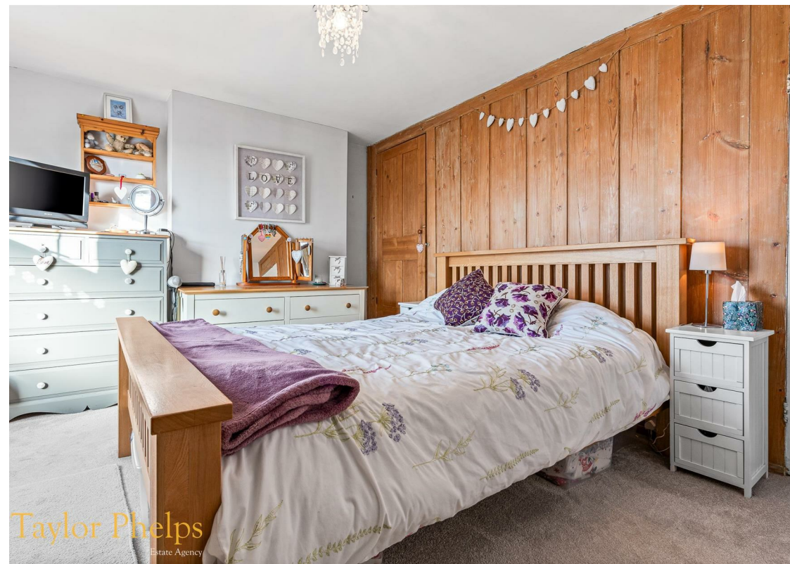
Taylor Phelps Estate Agency