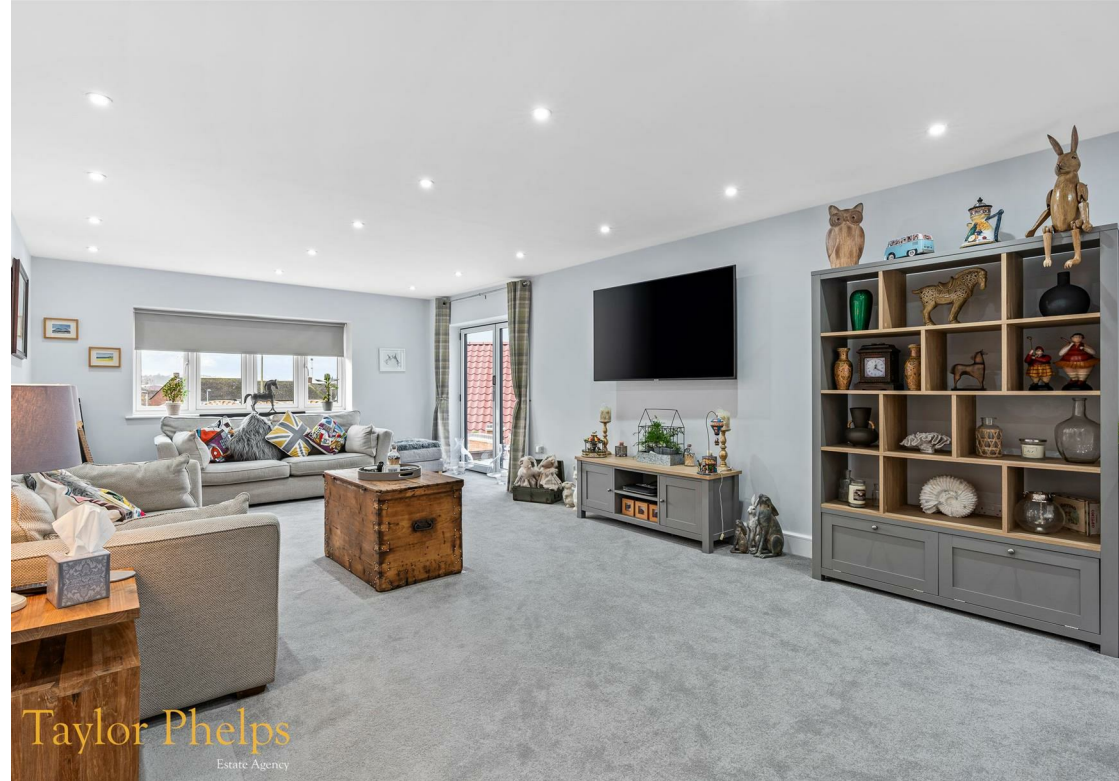
Taylor Phelps Estate Agency