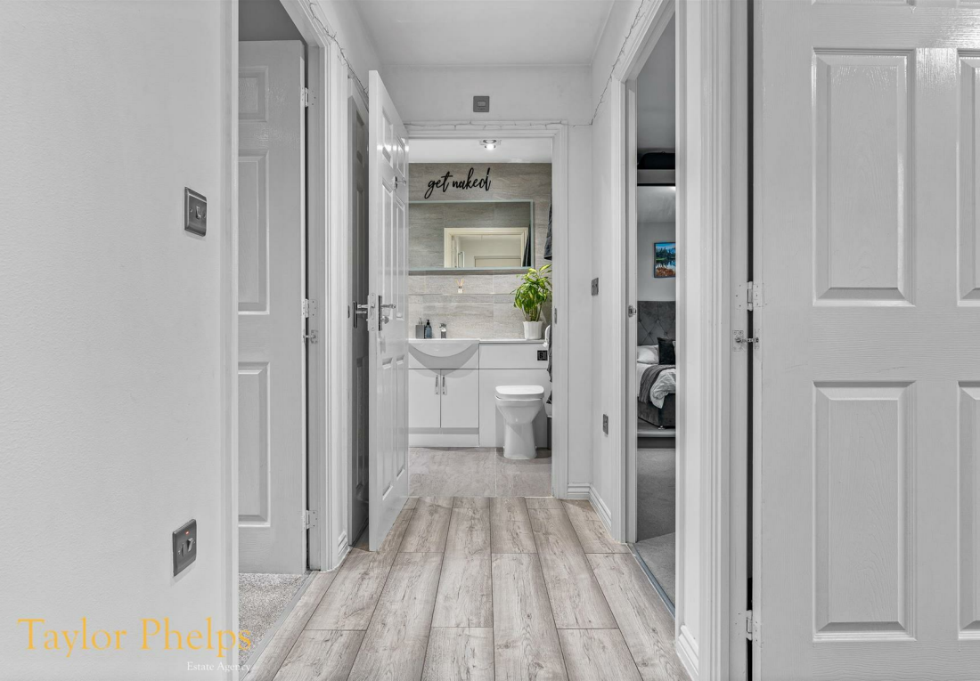
Taylor Phelps Estate Agency