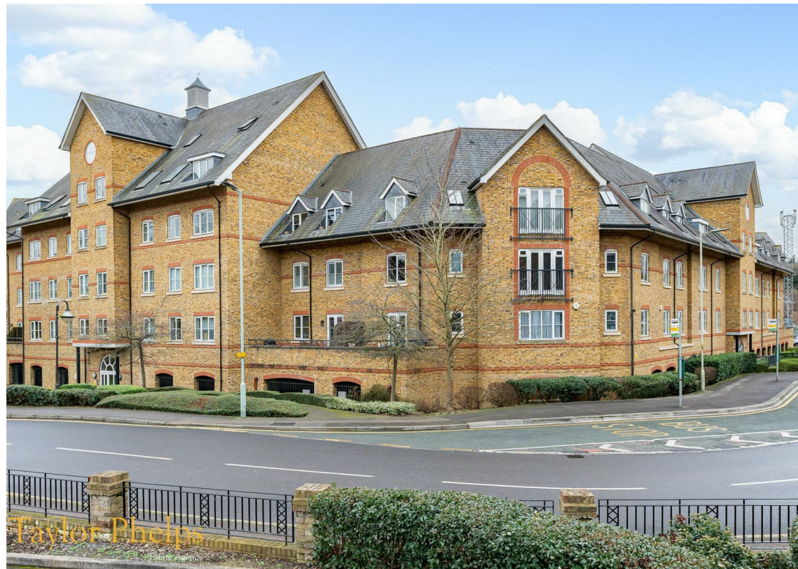
Taylor Phelps Estate Agency