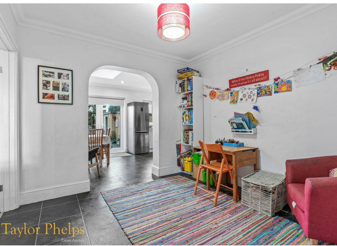
Taylor Phelps Estate Agency