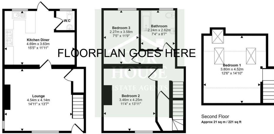
Ground Floor Approx 40 sq m / 436 sq ft

Approx Gross Internal Area 102 sq m / 1097 sq ft