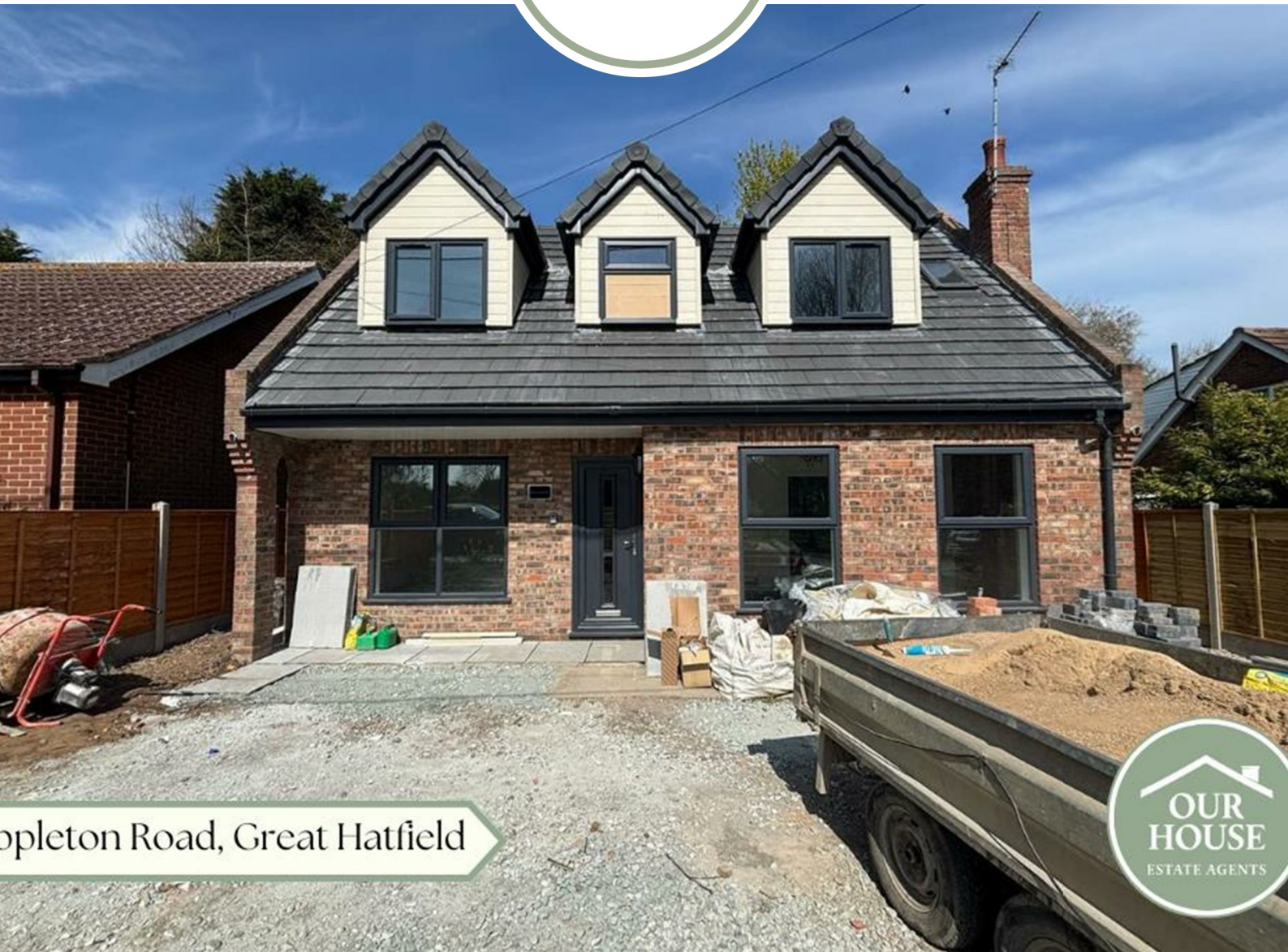
Mappleton Road, Great Hatfield