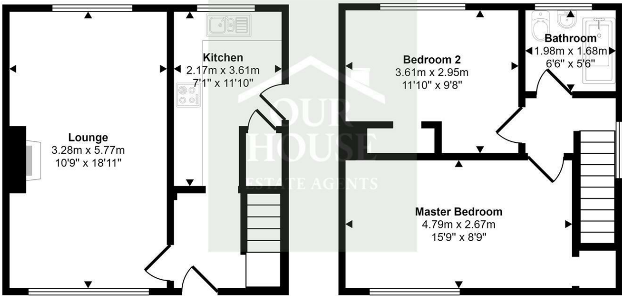
Ground Floor Approx 32 sq m / 349 sq ft

Approx Gross Internal Area 66 sq m / 706 sq ft