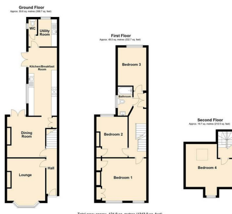
Total area: approx. 124.9 sq. metres (1343.9 sq. feet)