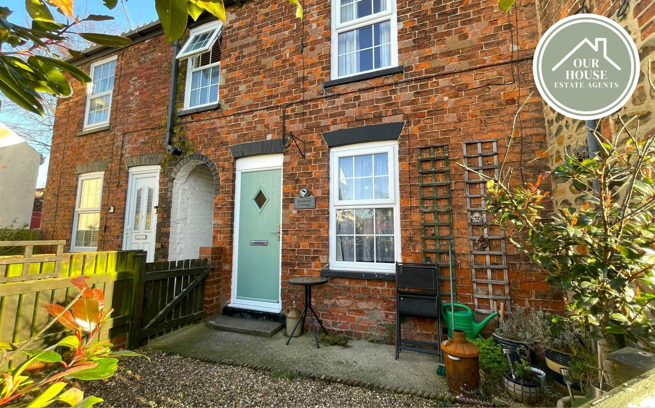
Seahorn Cottage Back Southgate, Hornsea, HU18 1BA