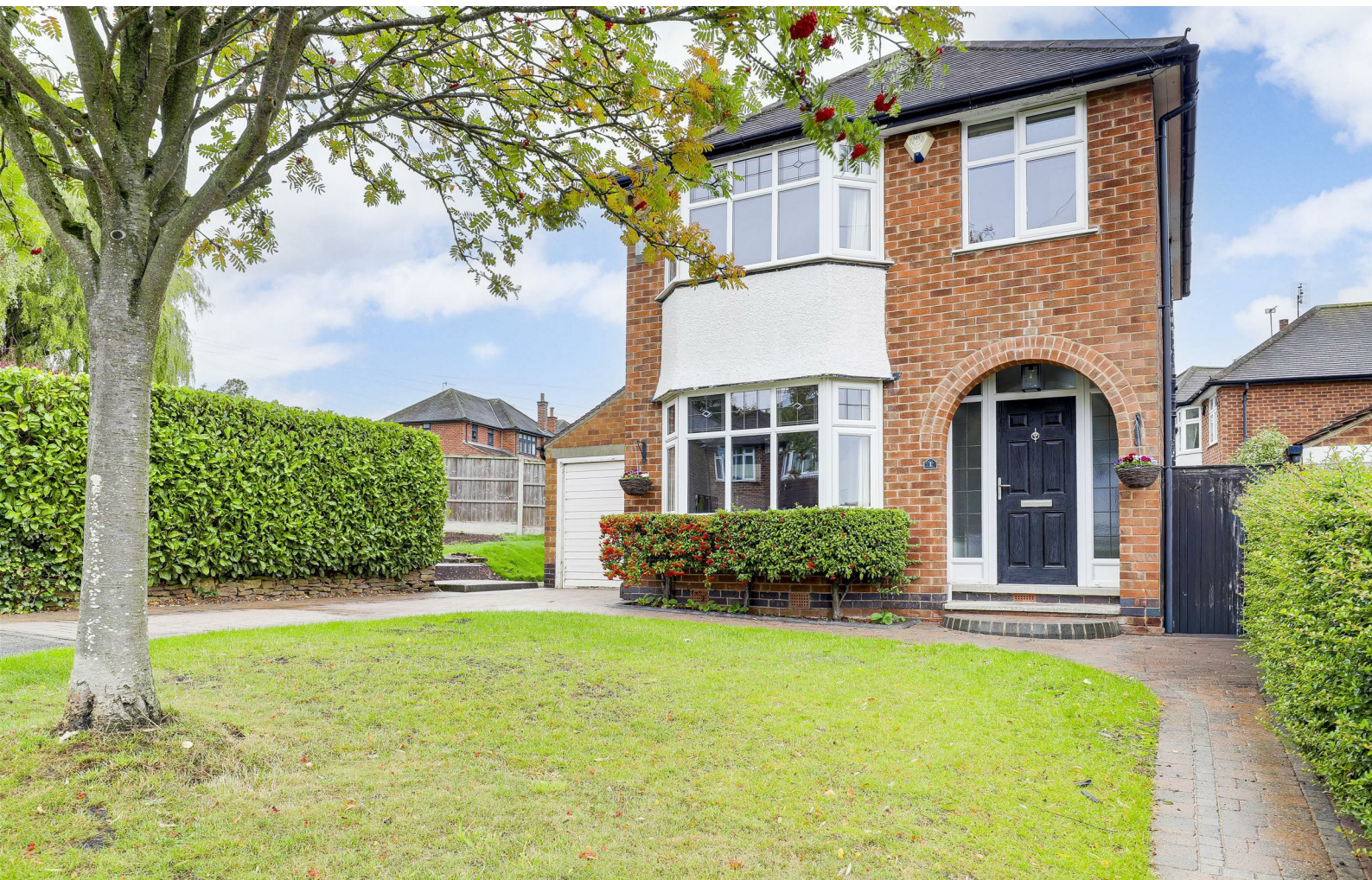
Lancelyn Gardens, West Bridgford, Nottinghamshire NG2 7FG