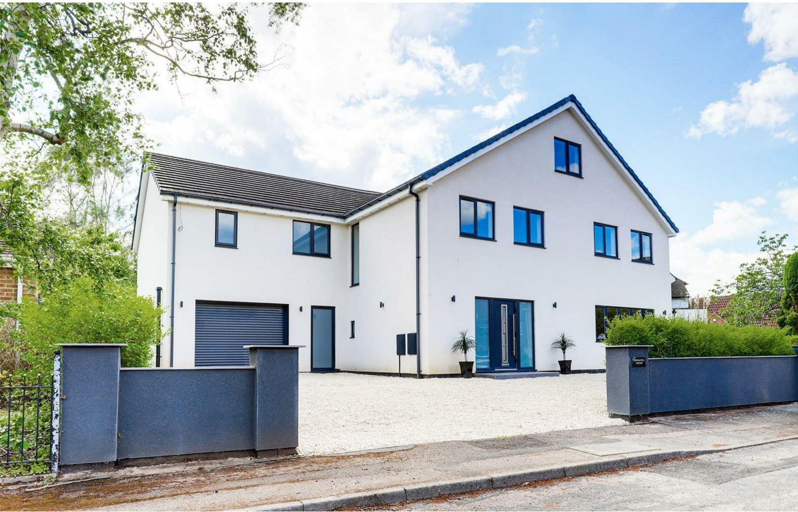
Cherry Tree Lane, Edwalton, Nottinghamshire NG12 4AL