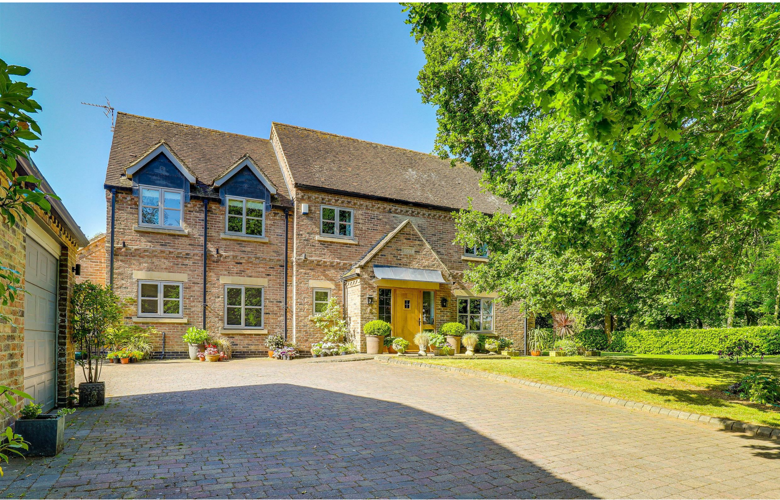
Holgate, Clifton Village, Nottinghamshire NG11 8NH