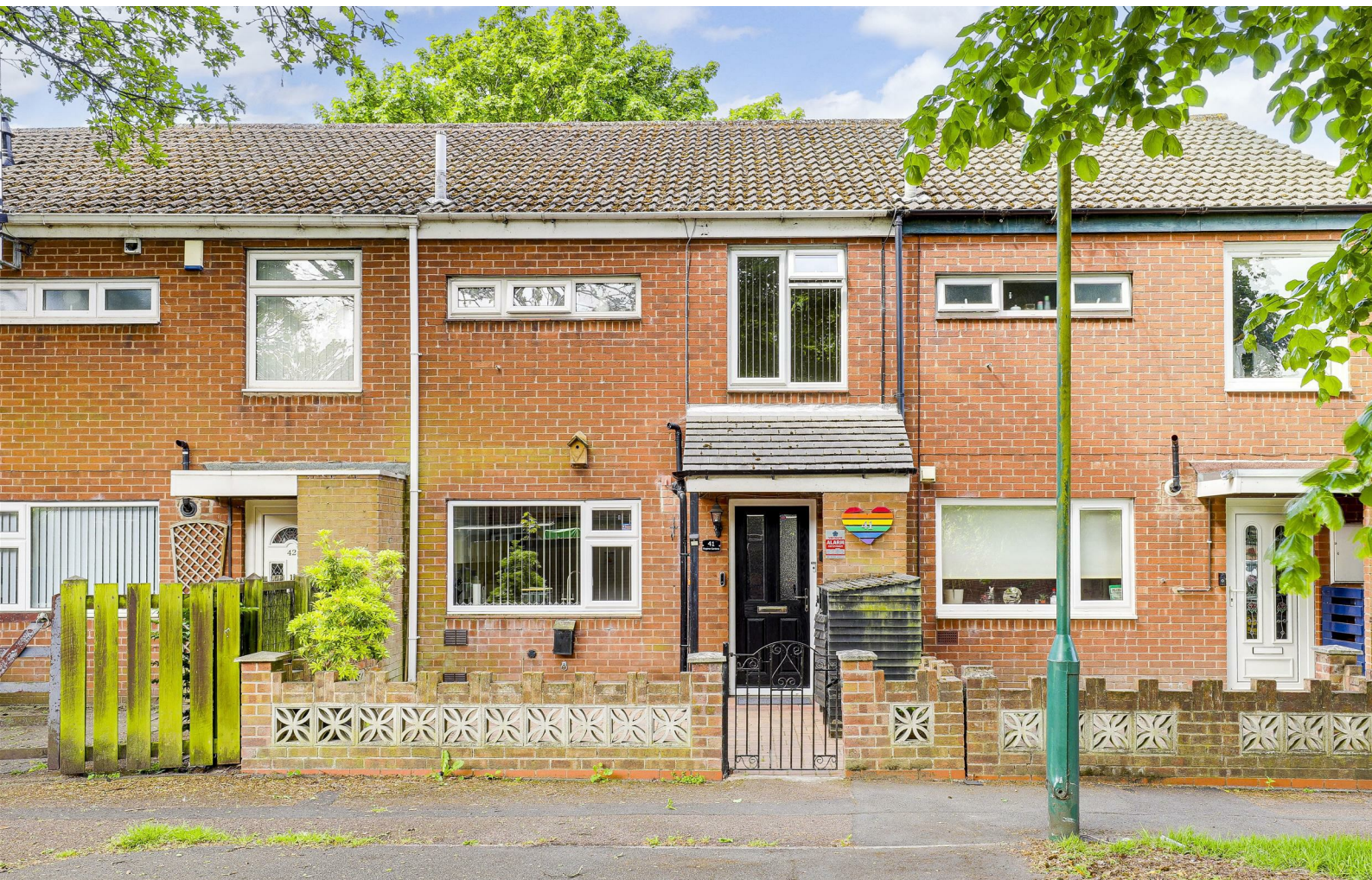
Eugene Gardens, The Meadows, Nottinghamshire NG2 3LF