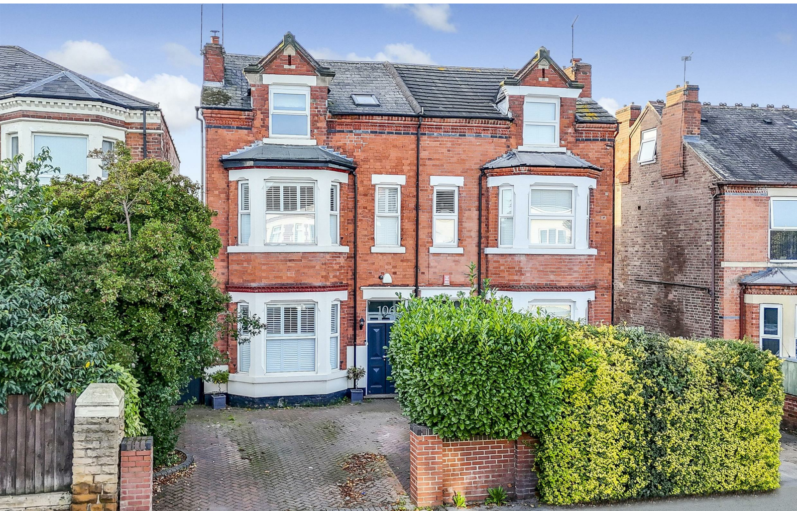
Loughborough Road, West Bridgford, Nottinghamshire NG2 7JH