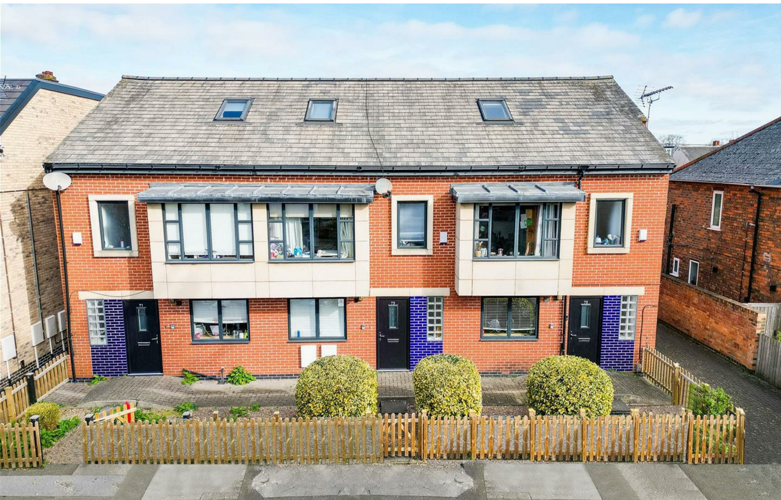
Eltham Road, West Bridgford, Nottinghamshire NG2 5JS