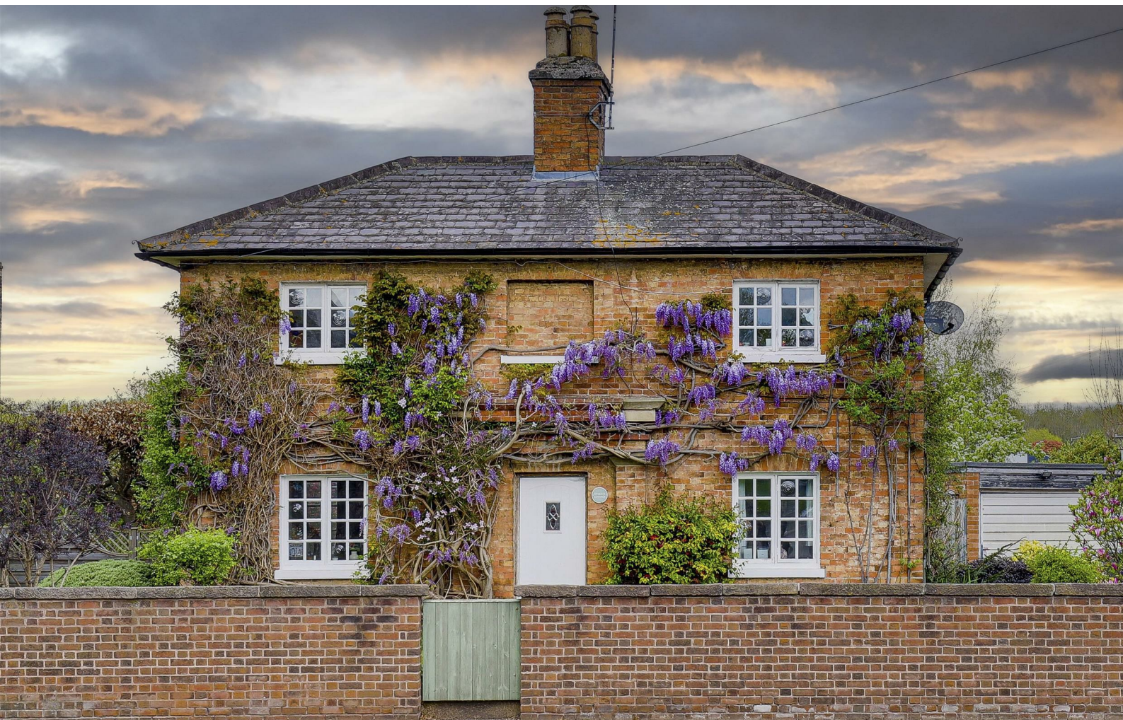
Bingham Road, Cotgrave, Nottinghamshire NG12 3JS