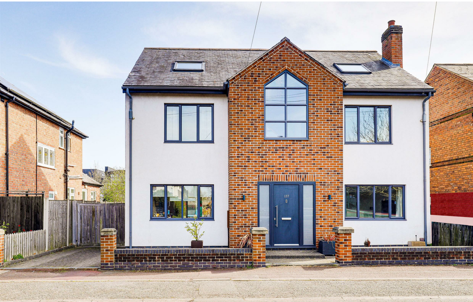
Gertrude Road, West Bridgford, Nottinghamshire NG2 5DA