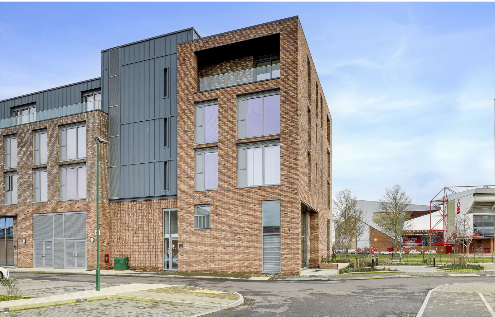
Trent Bridge View, Meadow Lane, Nottinghamshire NG2 3EZ