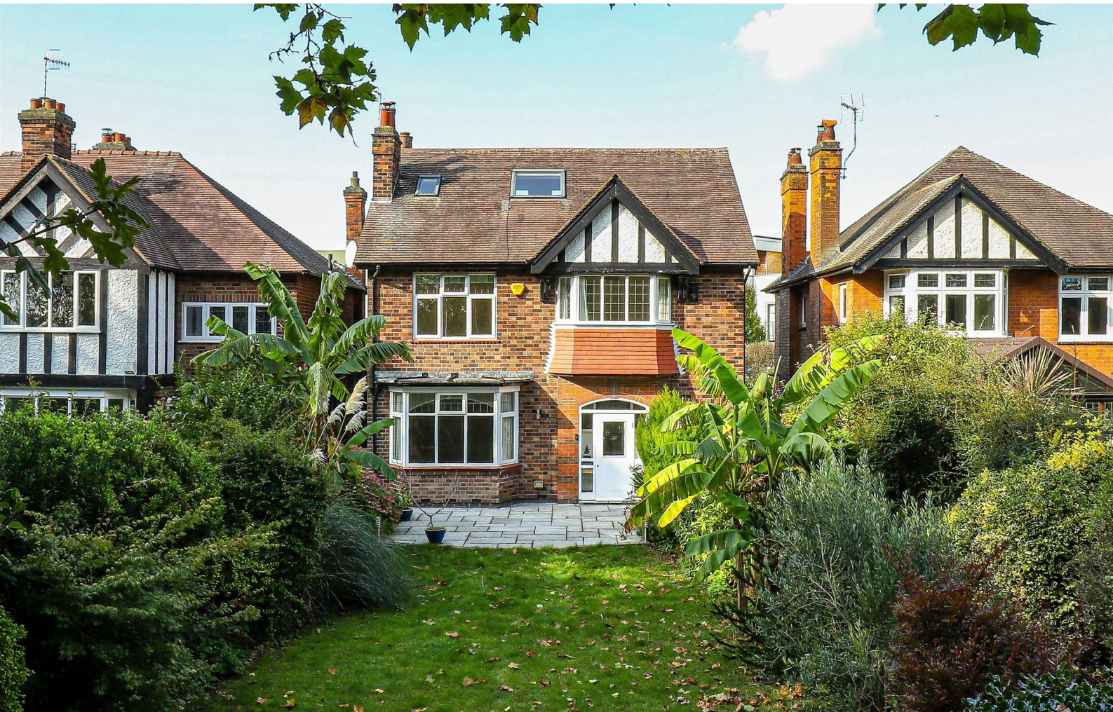
Victoria Embankment, Nottingham, Nottinghamshire NG2 2JY