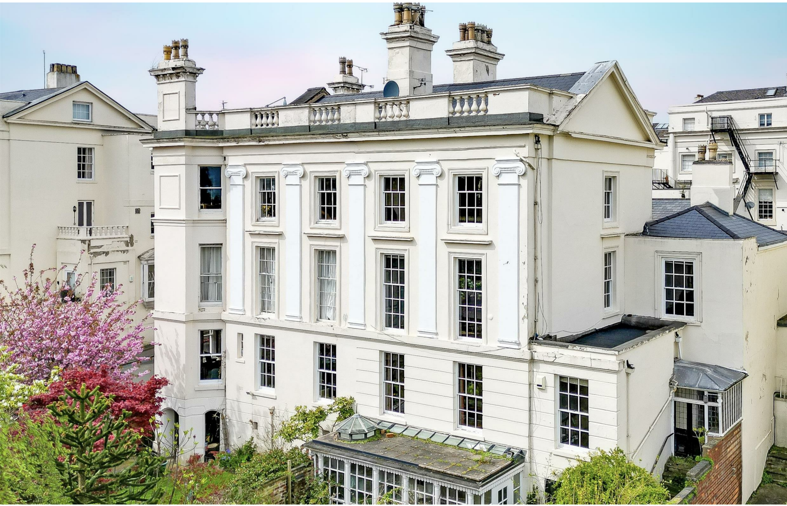
Western Terrace, The Park, Nottinghamshire NG7 1AF