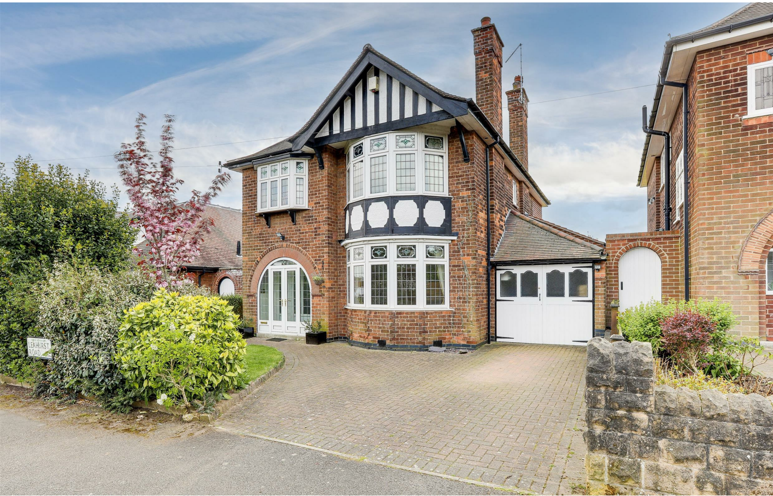
Leahurst Road, West Bridgford, Nottinghamshire NG2 6JG